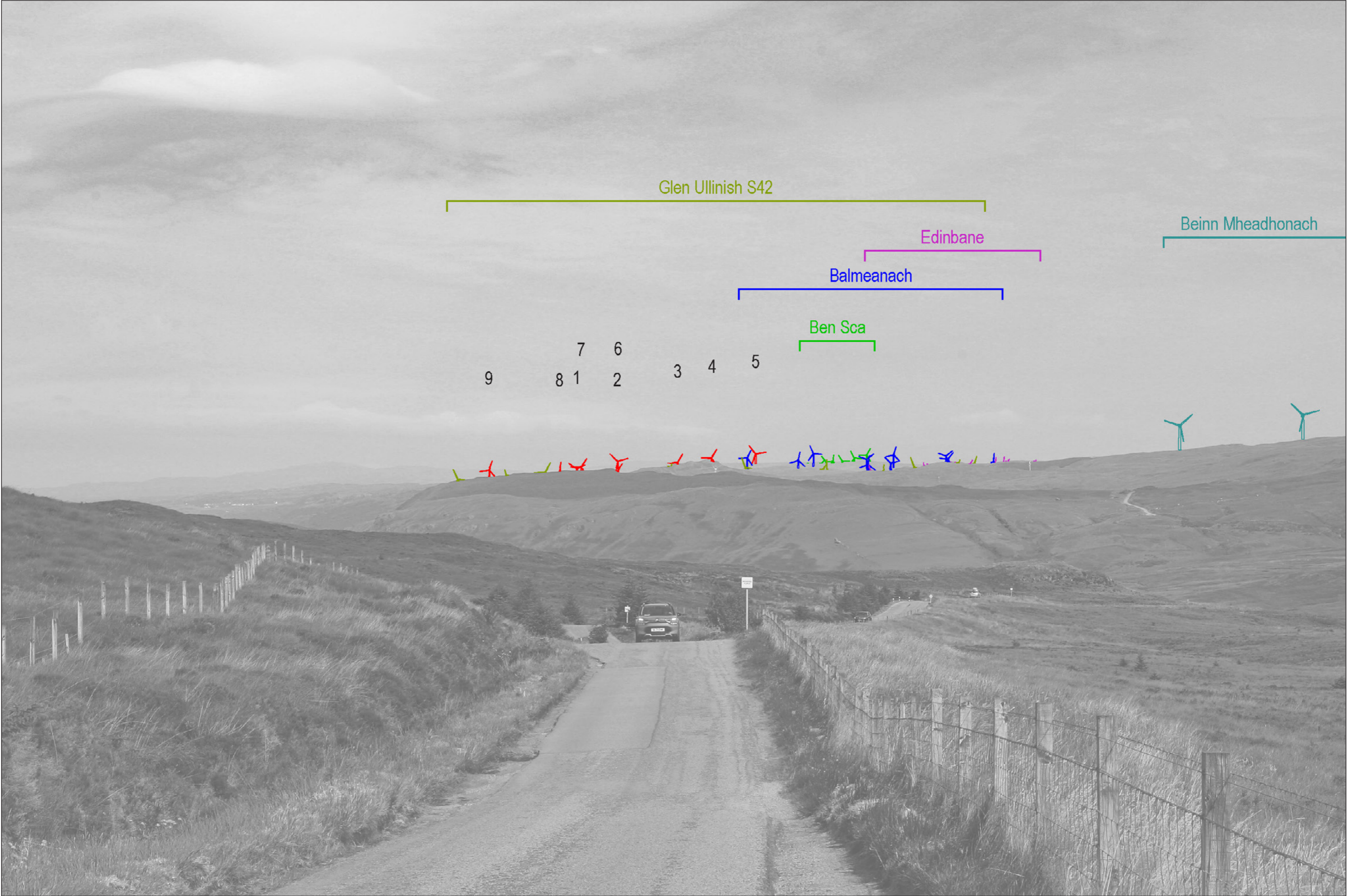
Viewpoint 16: Moineach Mararaulin - Monochrome Analysis

This image should be viewed at a comfortable arm's length (Approx. 500 mm)