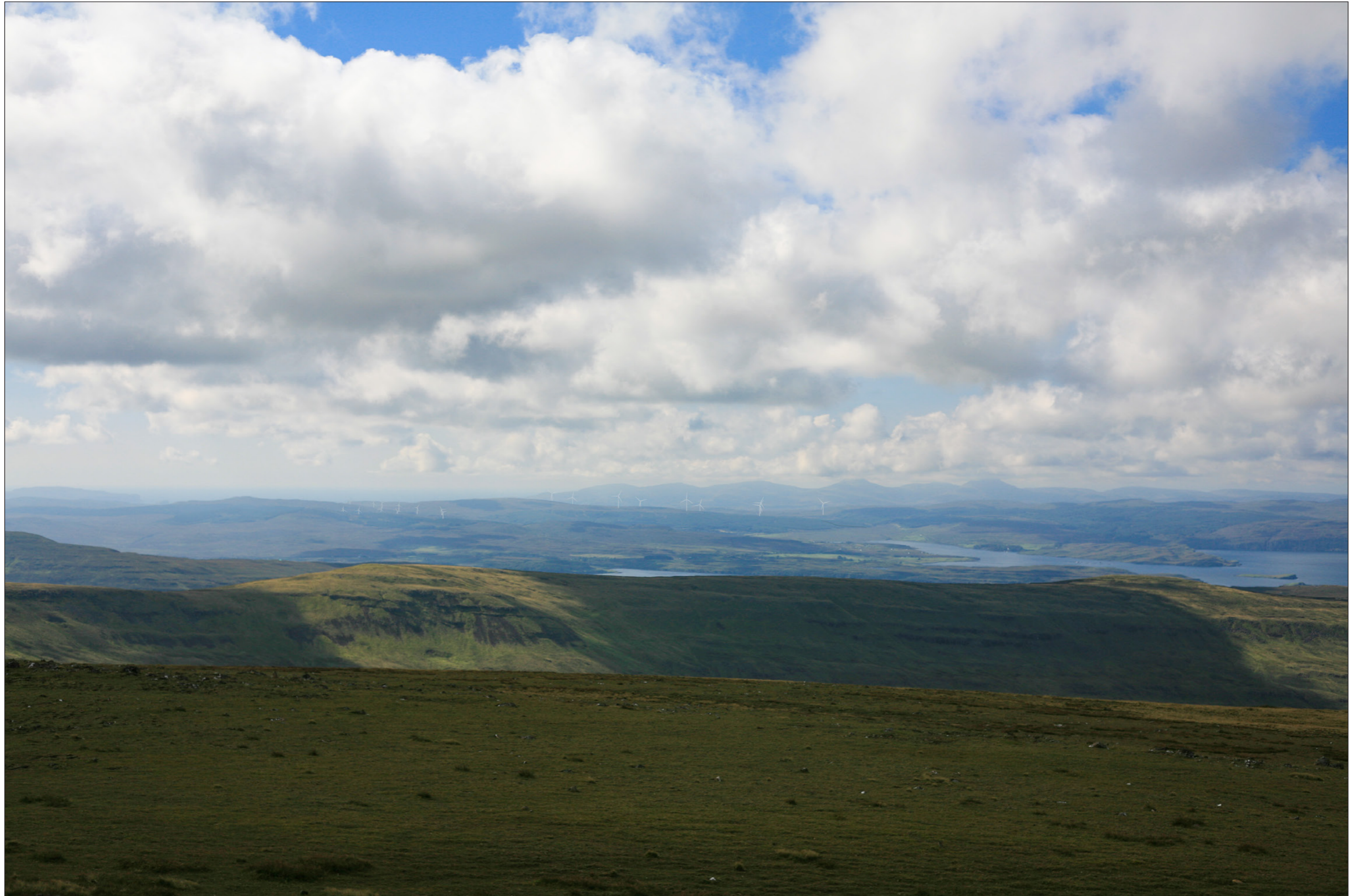
Viewpoint 17: Beinn Edra

When viewed at a comfortable arm's length (approx. 500 mm), this printed image is representative of our detailed central vision, but is not representative of scale and distance.