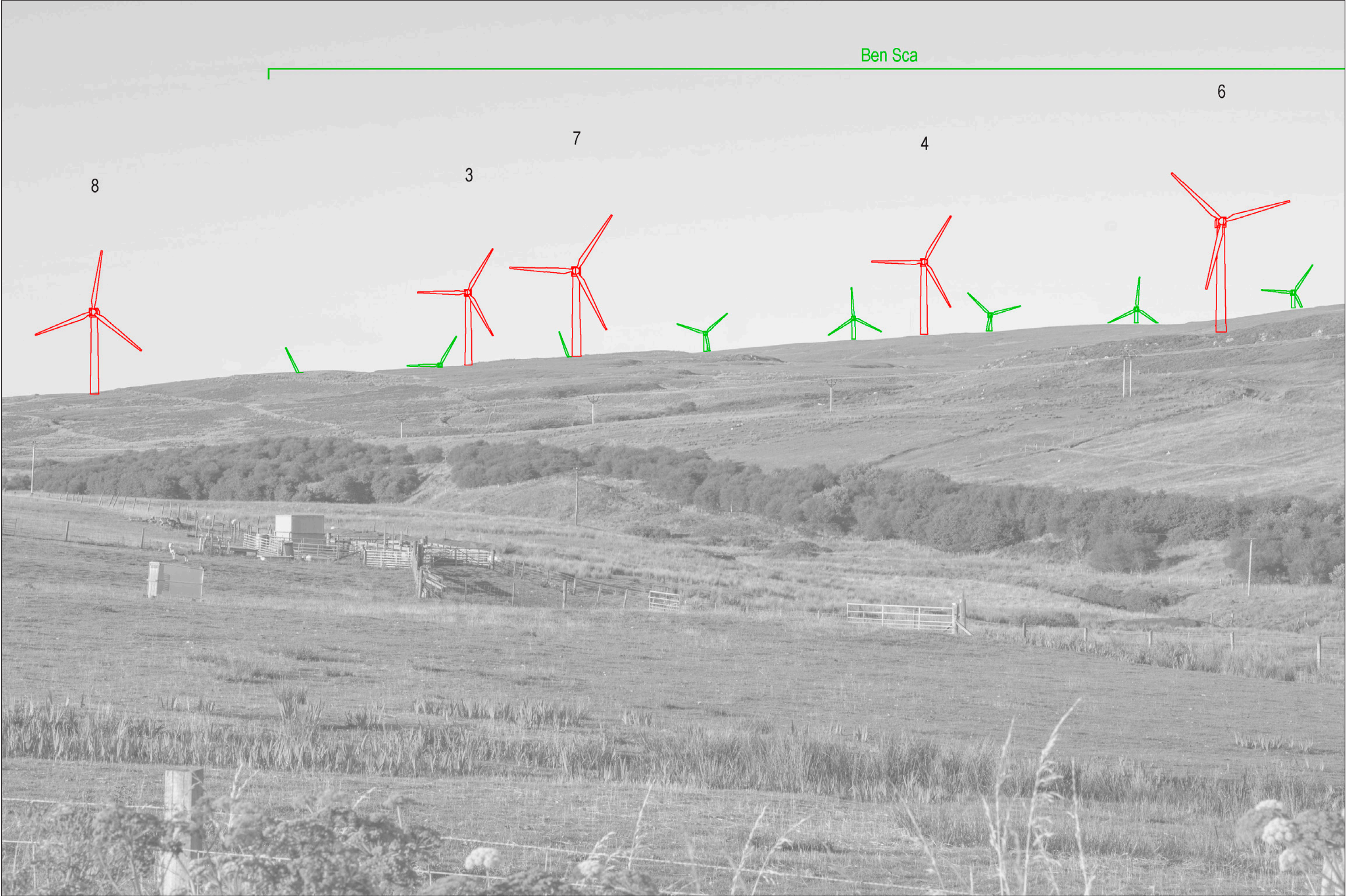
Viewpoint 2: A863 at Feorlig - Monochrome Analysis

This image should be viewed at a comfortable arm's length (Approx. 500 mm)