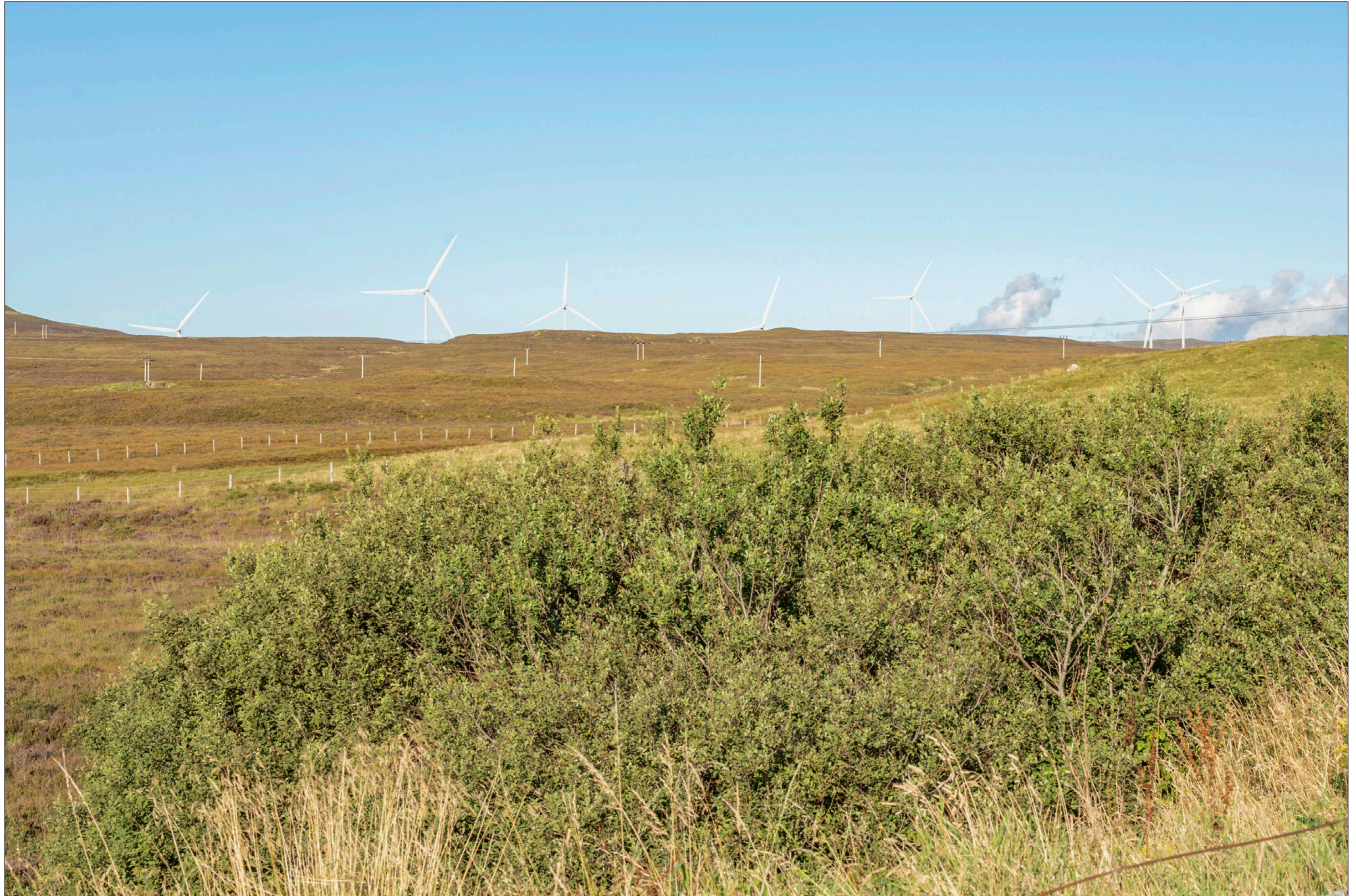
Viewpoint 3: A863 south of Dunvegan

This image should be viewed at a comfortable arm's length (Approx. 500 mm)