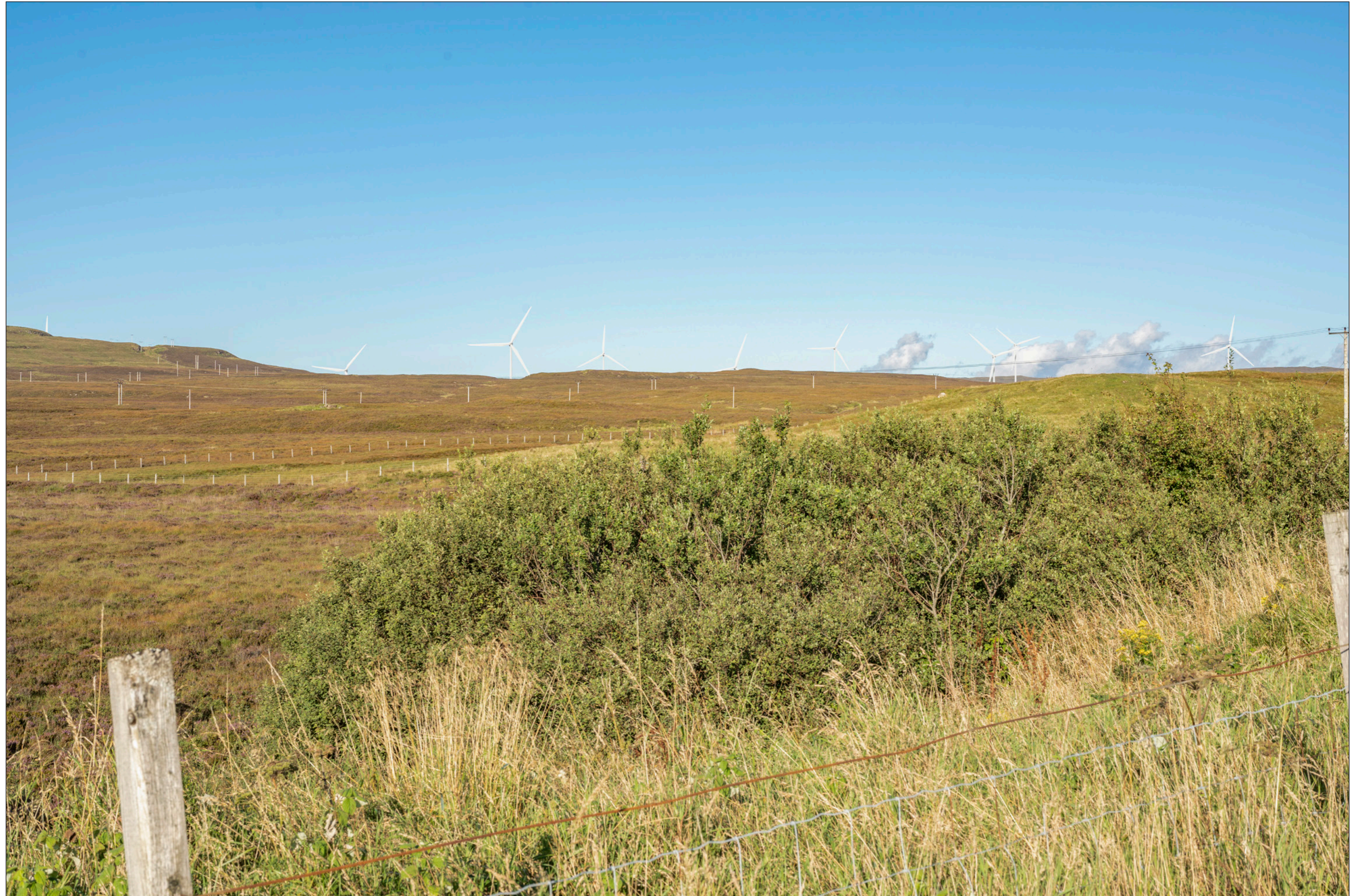
Viewpoint 3: A863 south of Dunvegan

When viewed at a comfortable arm's length (approx. 500 mm), this printed image is representative of our detailed central vision, but is not representative of scale and distance.