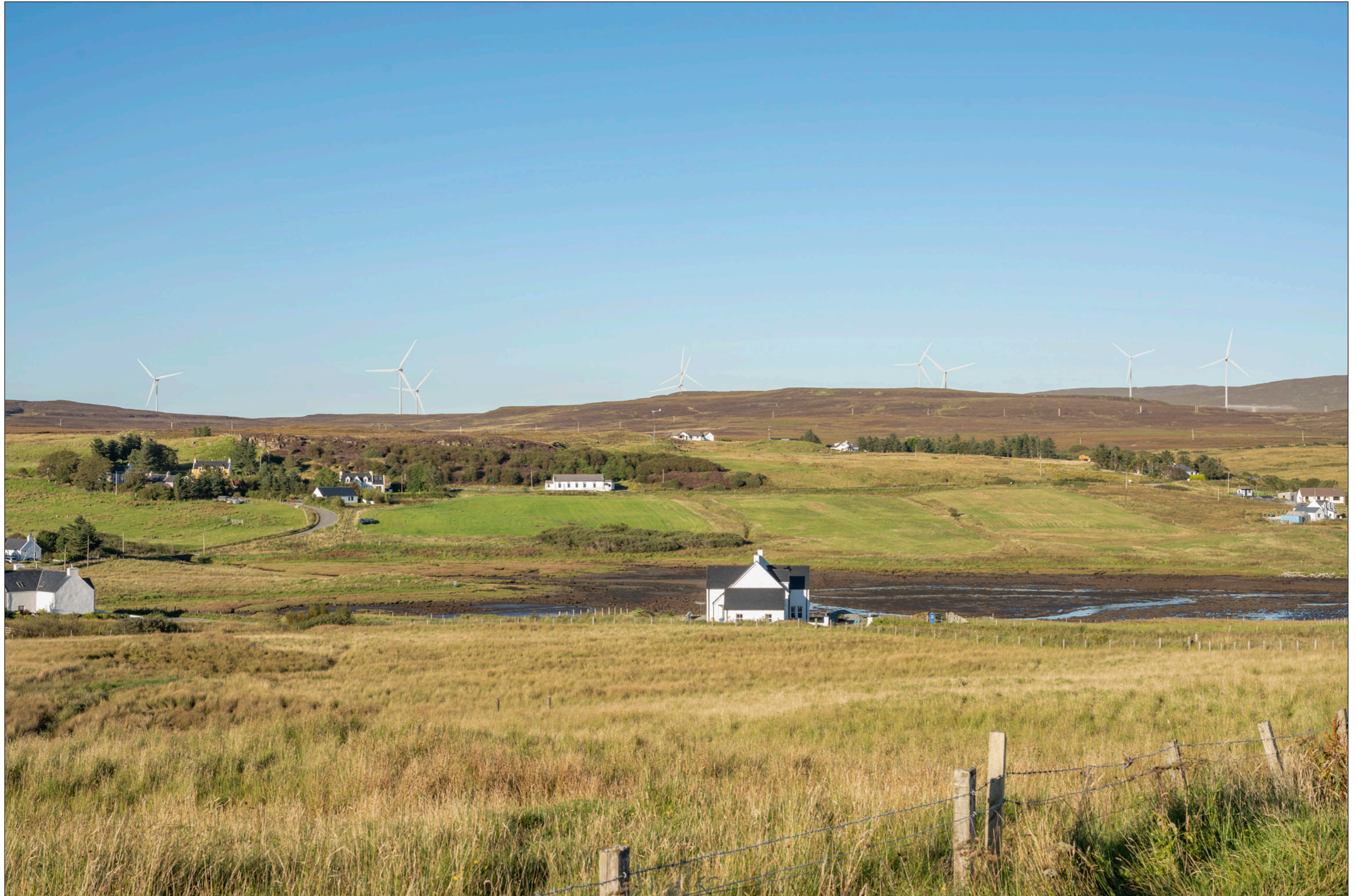
Viewpoint 5: Roag

When viewed at a comfortable arm's length (approx. 500 mm), this printed image is representative of our detailed central vision, but is not representative of scale and distance.