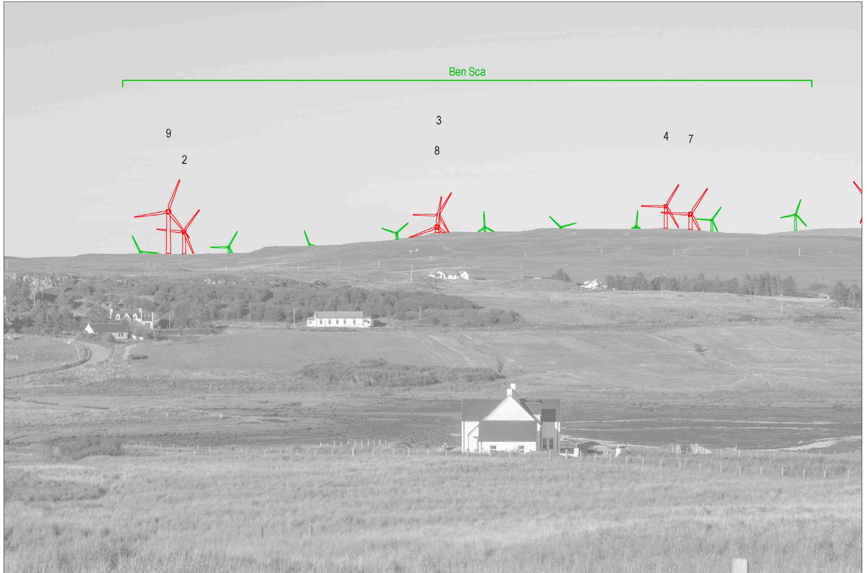
Viewpoint 5: Roag - Monochrome Analysis

This image should be viewed at a comfortable arm's length (Approx. 500 mm)