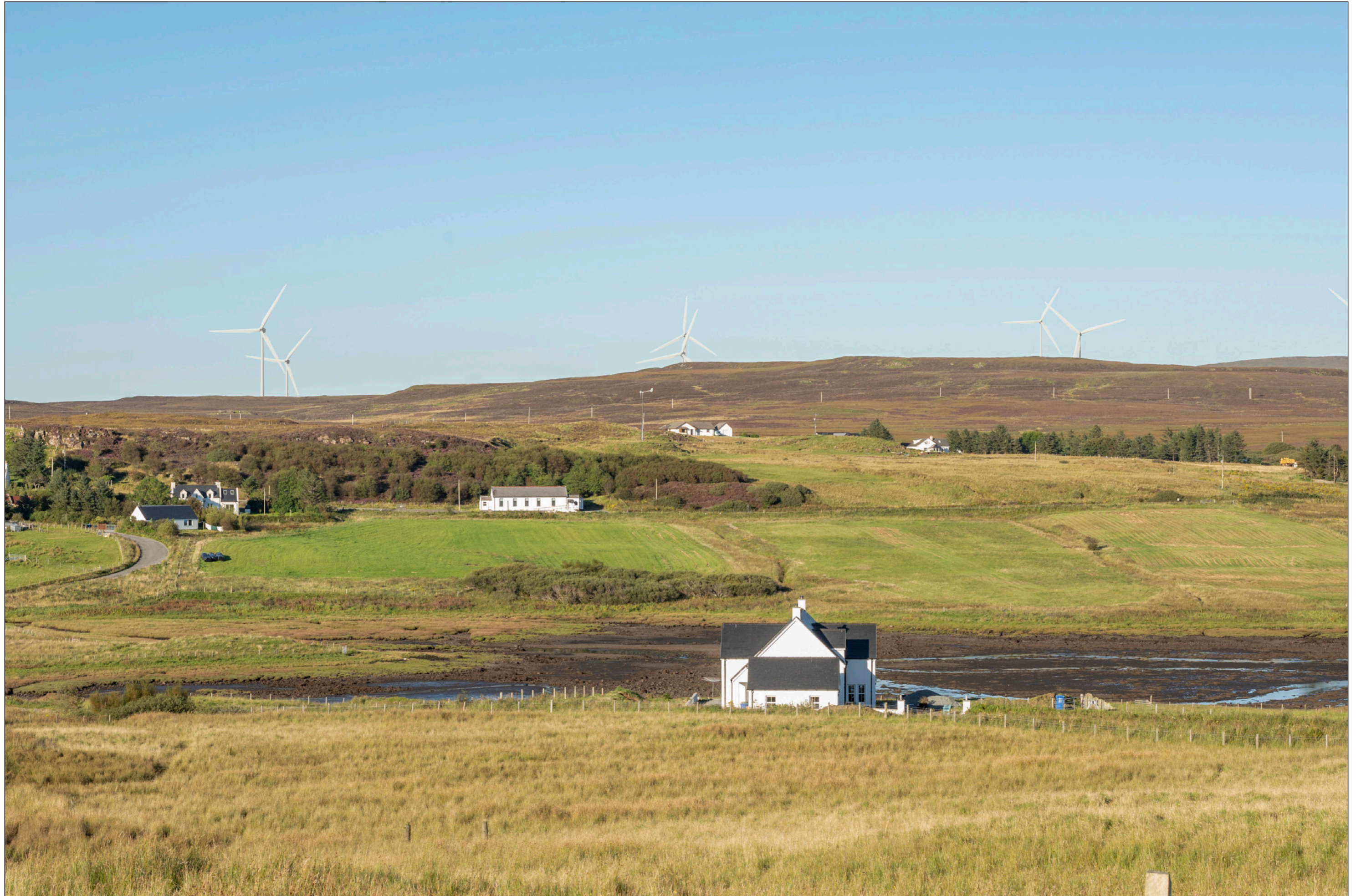
Viewpoint 5: Roag

This image should be viewed at a comfortable arm's length (Approx. 500 mm)