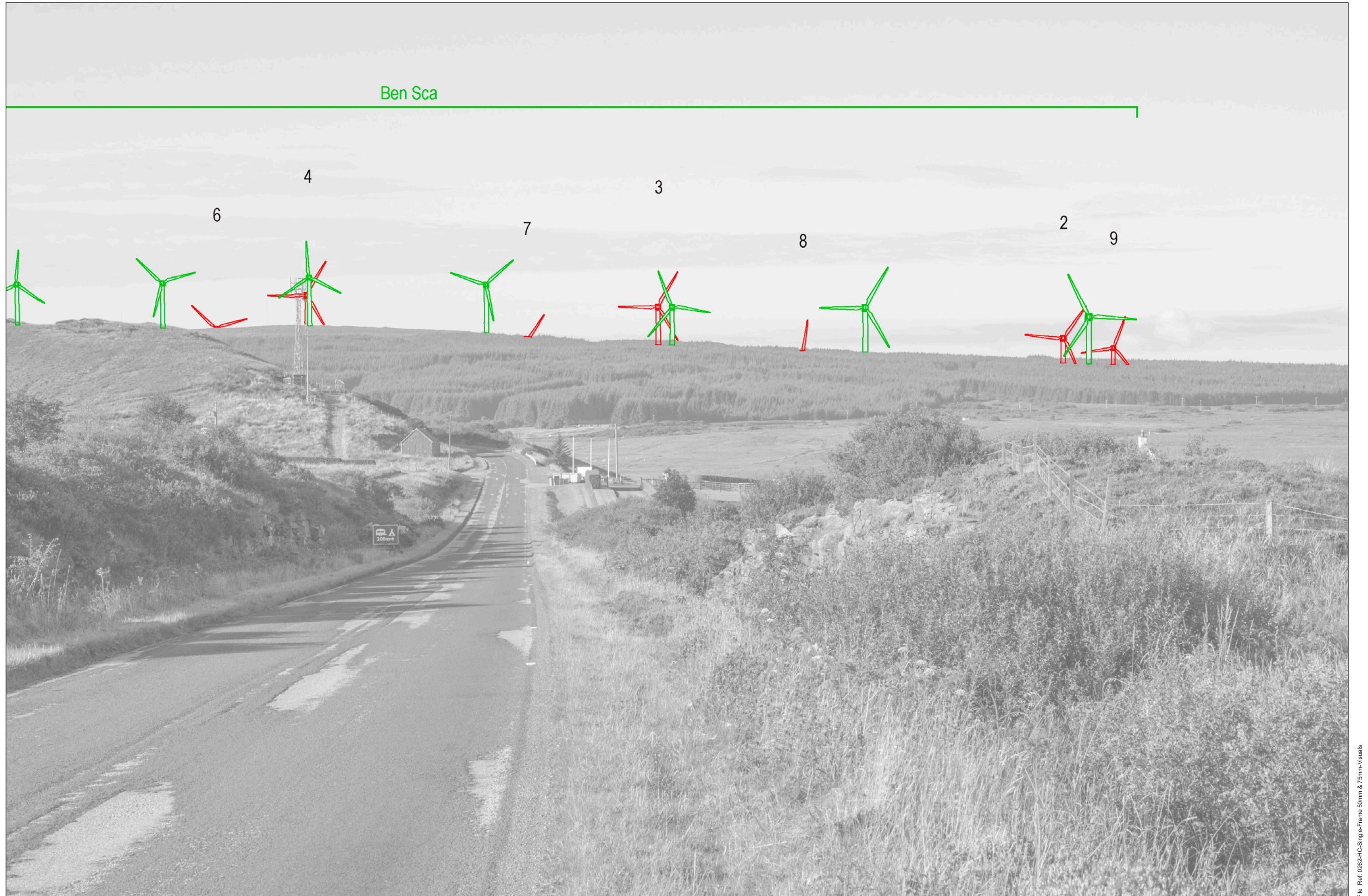
Viewpoint 6: A850 Flashader - Monochrome Analysis

This image should be viewed at a comfortable arm's length (Approx. 500 mm)