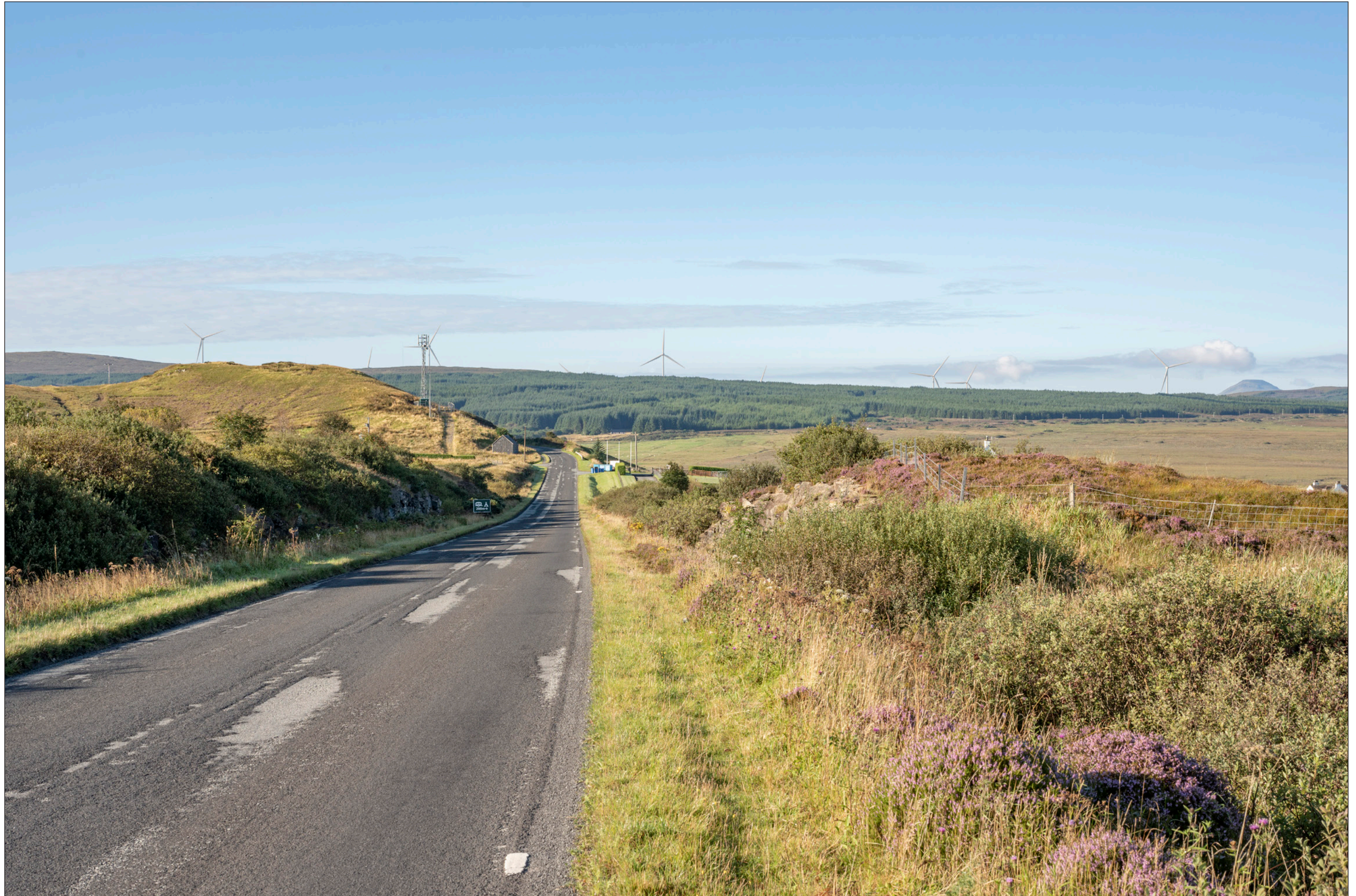
Viewpoint 6: A850 Flashader

When viewed at a comfortable arm's length (approx. 500 mm), this printed image is representative of our detailed central vision, but is not representative of scale and distance.