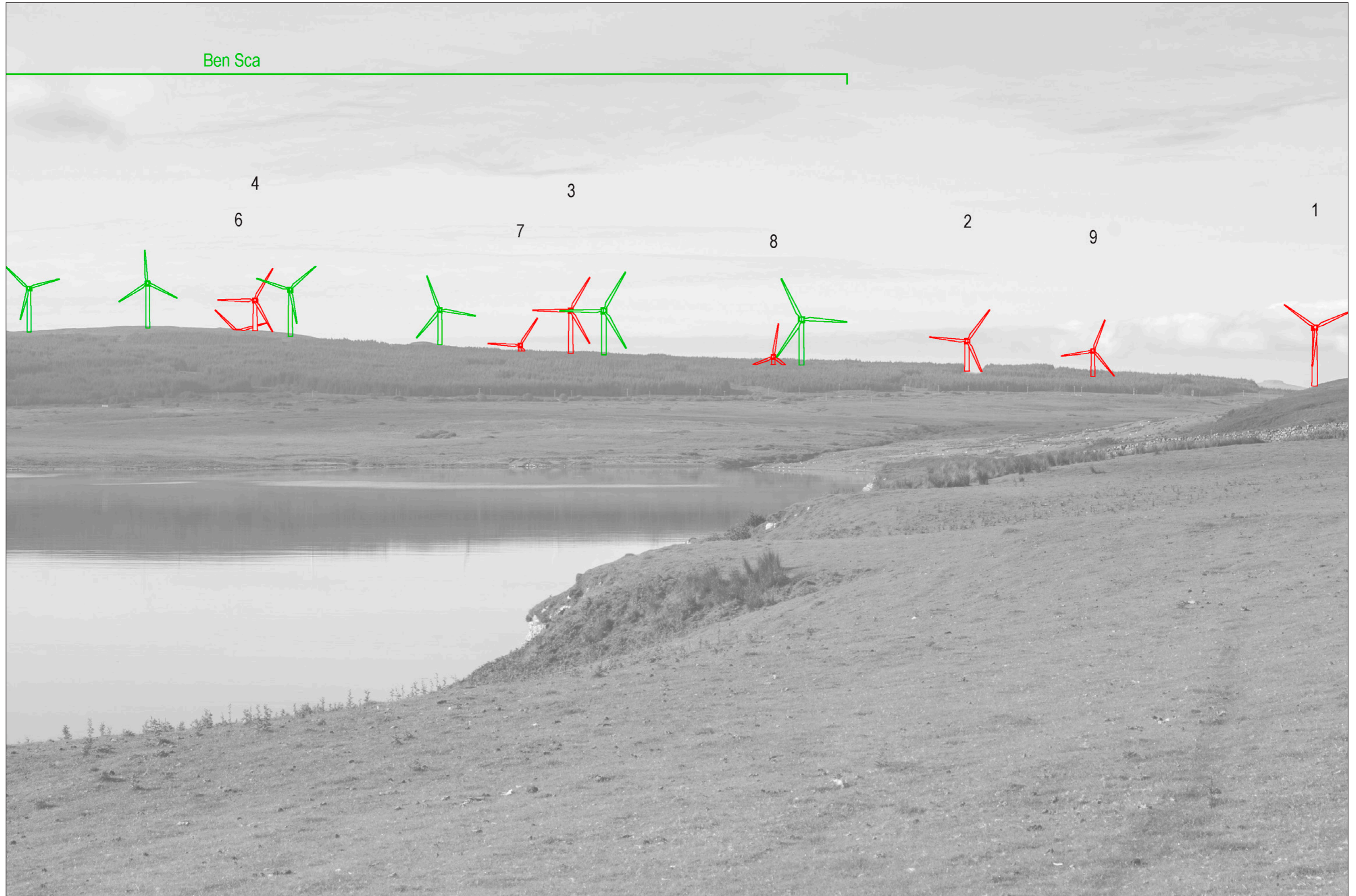
Viewpoint 7: Minor Road to Greshornish - Monochrome Analysis

This image should be viewed at a comfortable arm's length (Approx. 500 mm)