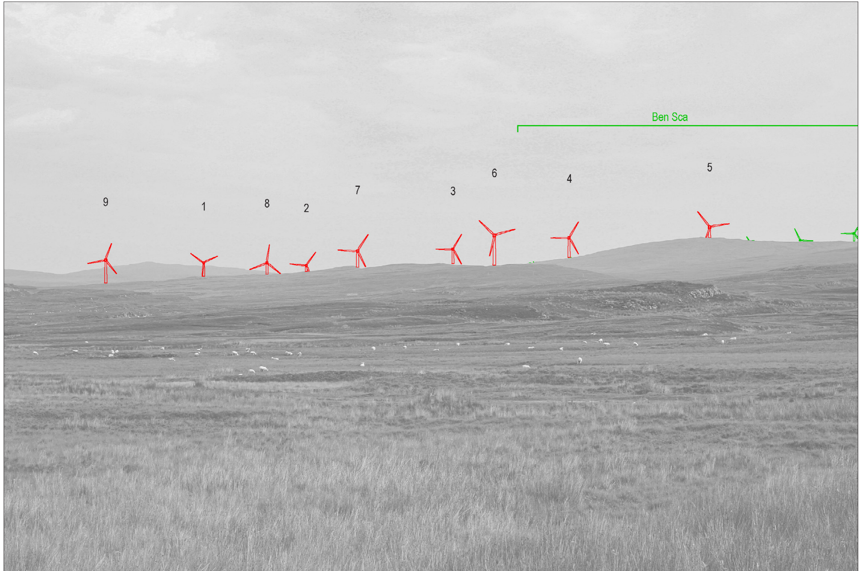
Viewpoint 8: A863 near Gearymore - Monochrome Analysis

This image should be viewed at a comfortable arm's length (Approx. 500 mm)