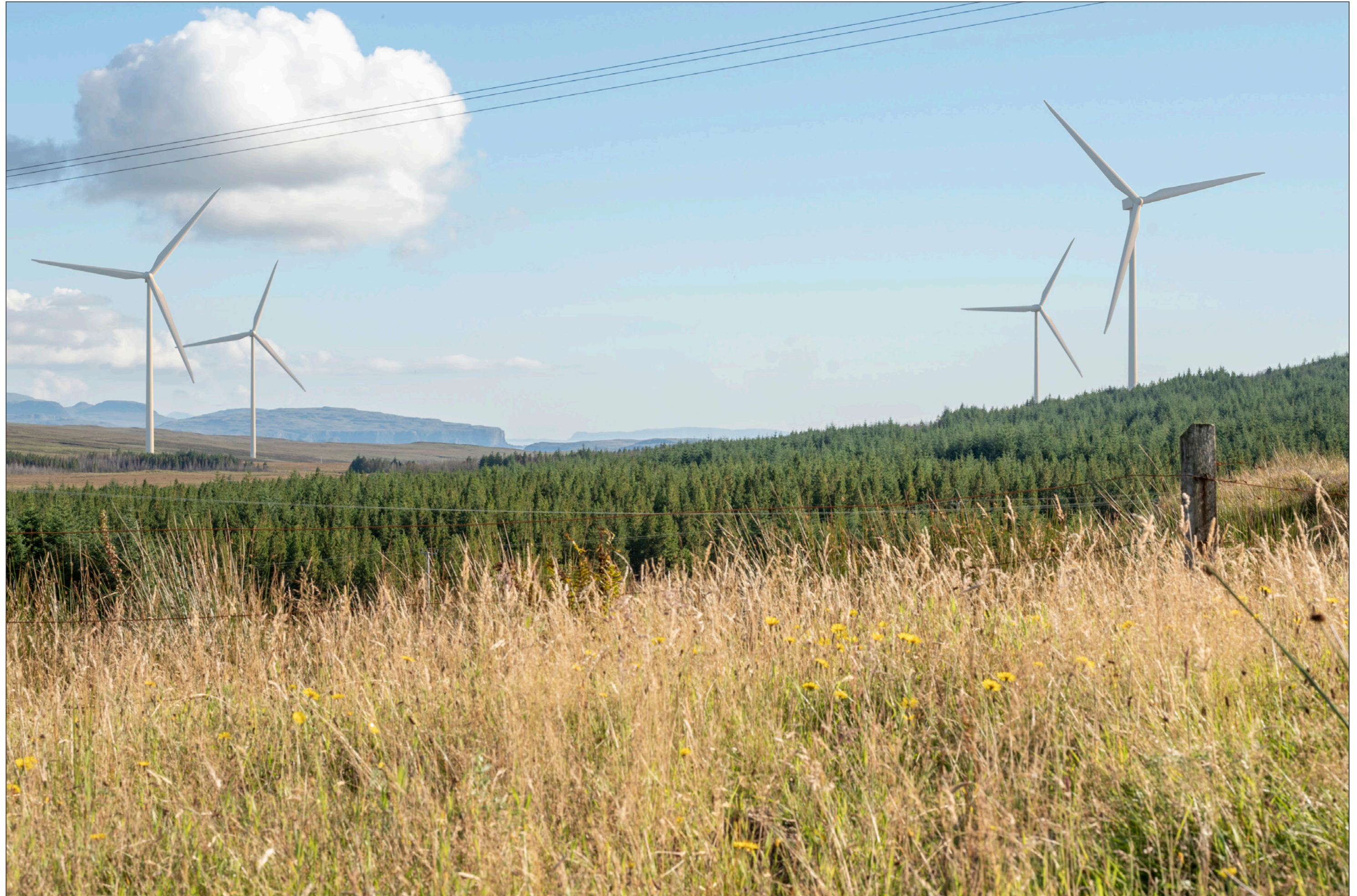
Viewpoint 1: A850 north of site

This image should be viewed at a comfortable arm's length (Approx. 500 mm)