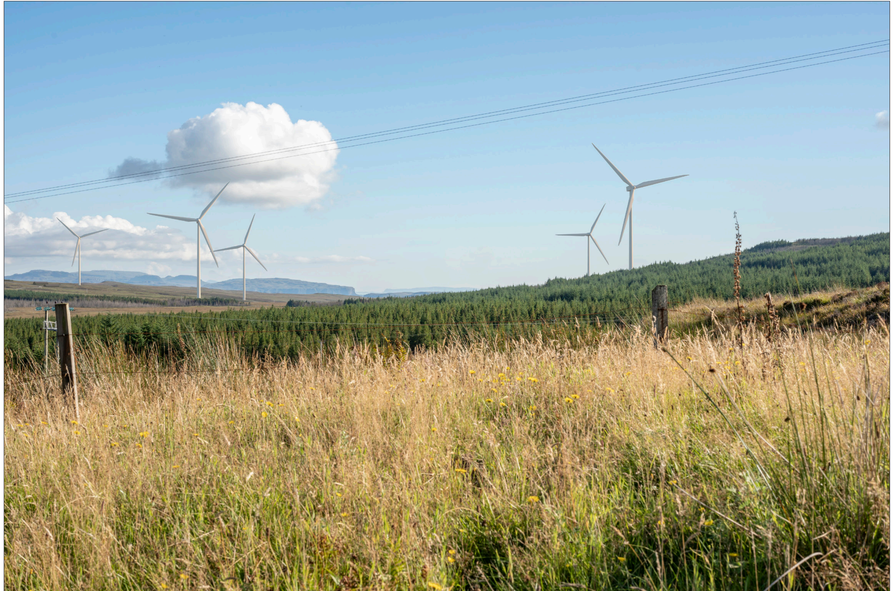
Viewpoint 1: A850 north of site

When viewed at a comfortable arm's length (approx. 500 mm), this printed image is representative of our detailed central vision, but is not representative of scale and distance.