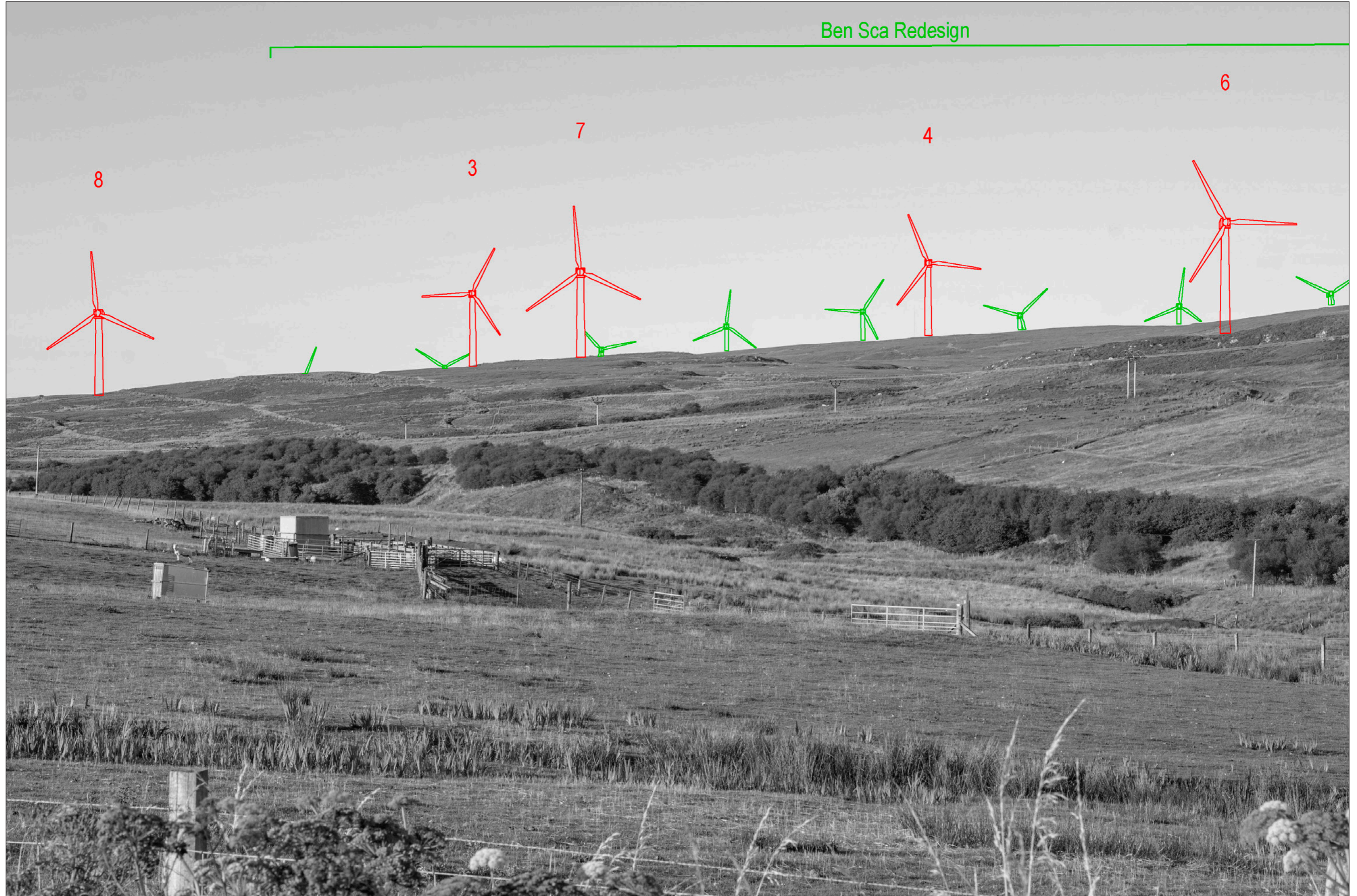
Viewpoint 2: A863 at Feorlig - Monochrome Analysis

This image should be viewed at a comfortable arm's length (Approx. 500 mm)