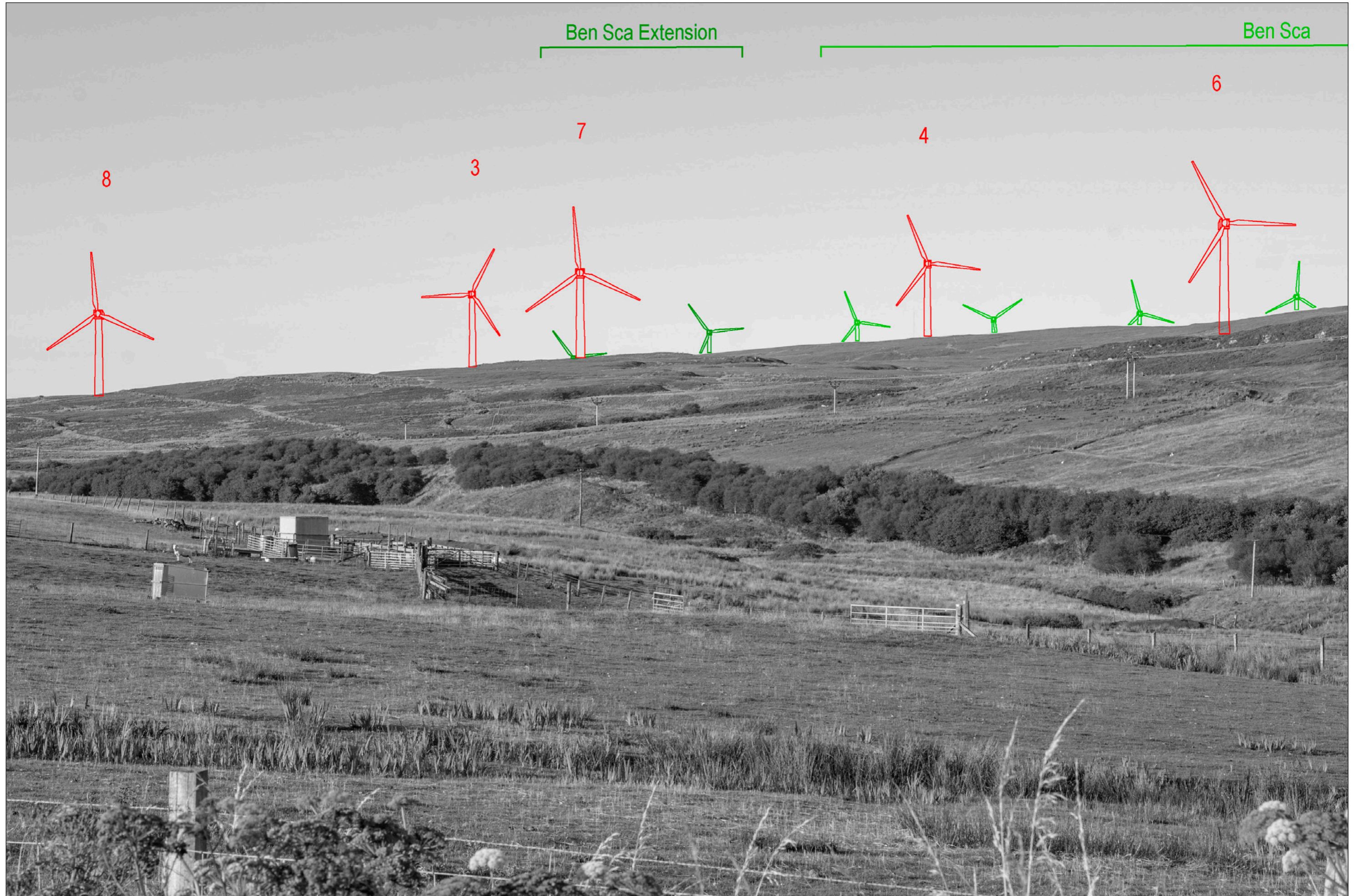
Viewpoint 2: A863 at Feorlig - Monochrome Analysis

This image should be viewed at a comfortable arm's length (Approx. 500 mm)