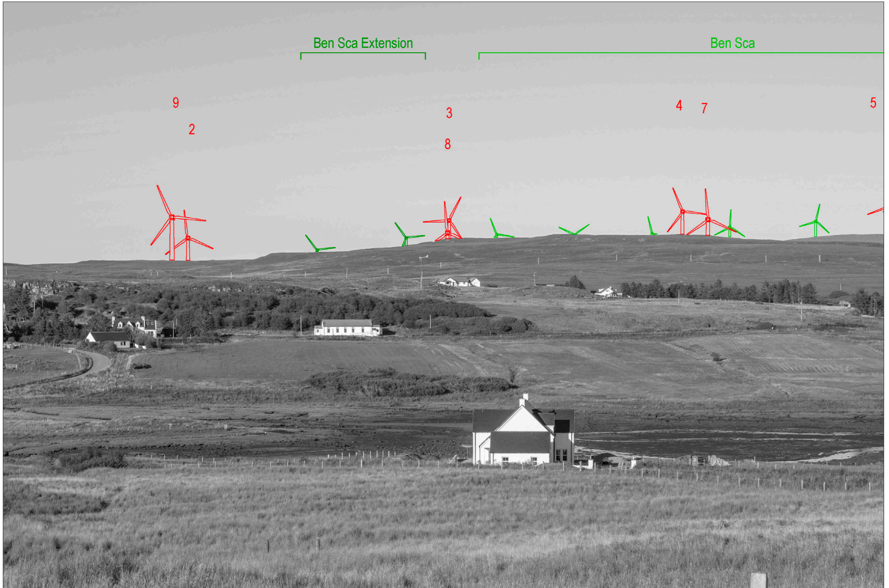
Viewpoint 5: Roag - Monochrome Analysis

This image should be viewed at a comfortable arm's length (Approx. 500 mm)