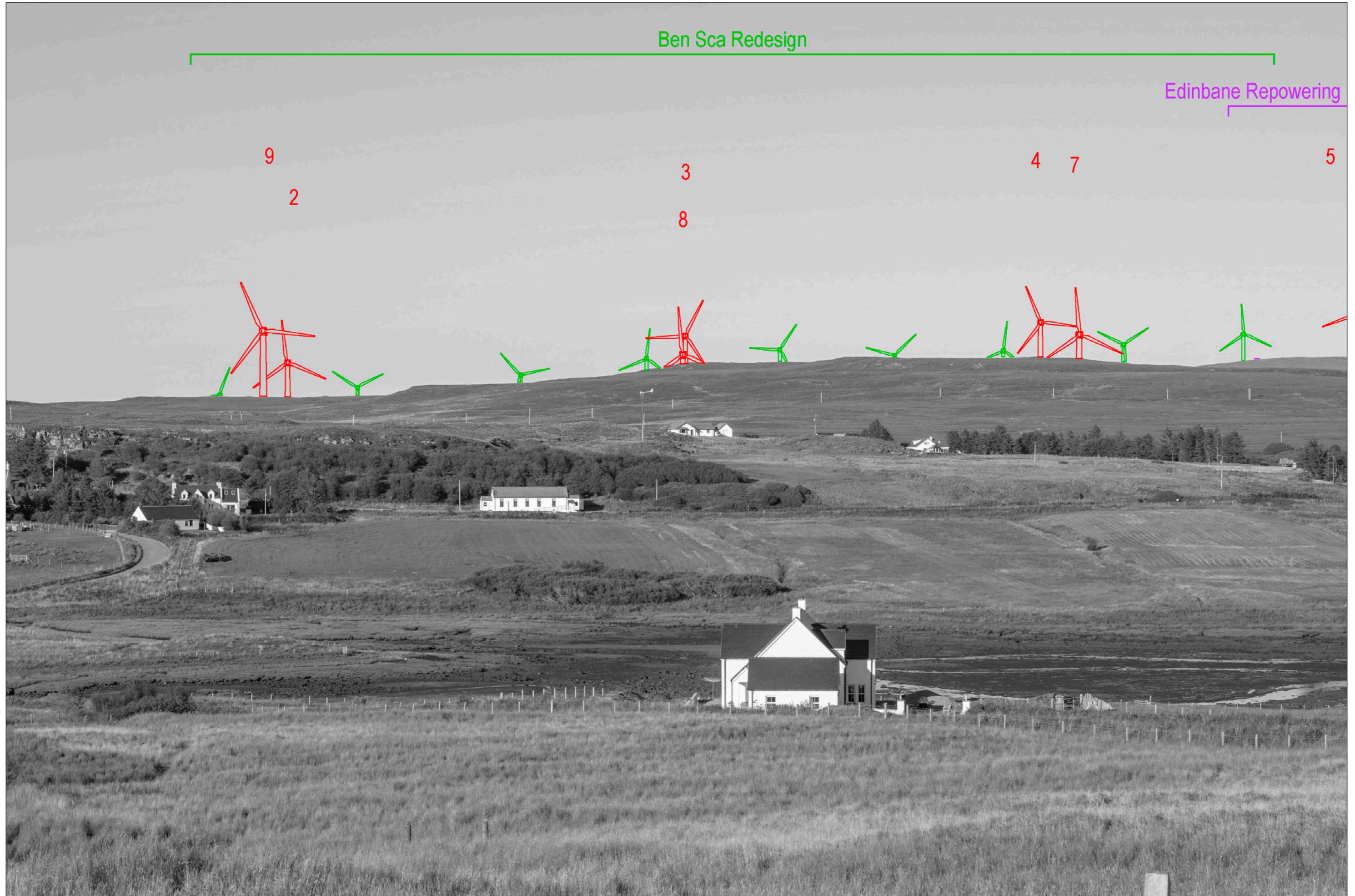
Viewpoint 5: Roag - Monochrome Analysis

This image should be viewed at a comfortable arm's length (Approx. 500 mm)