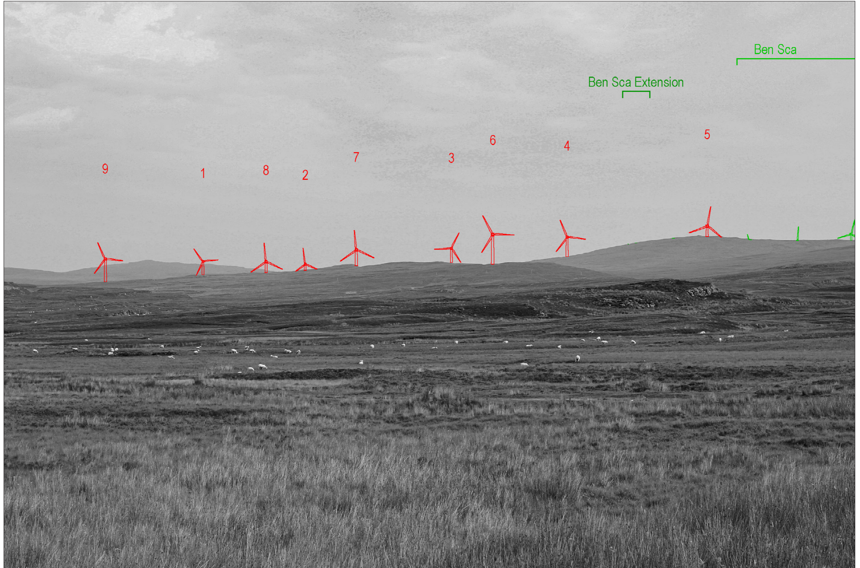
Viewpoint 8: A863 near Gearymore - Monochrome Analysis

This image should be viewed at a comfortable arm's length (Approx. 500 mm)