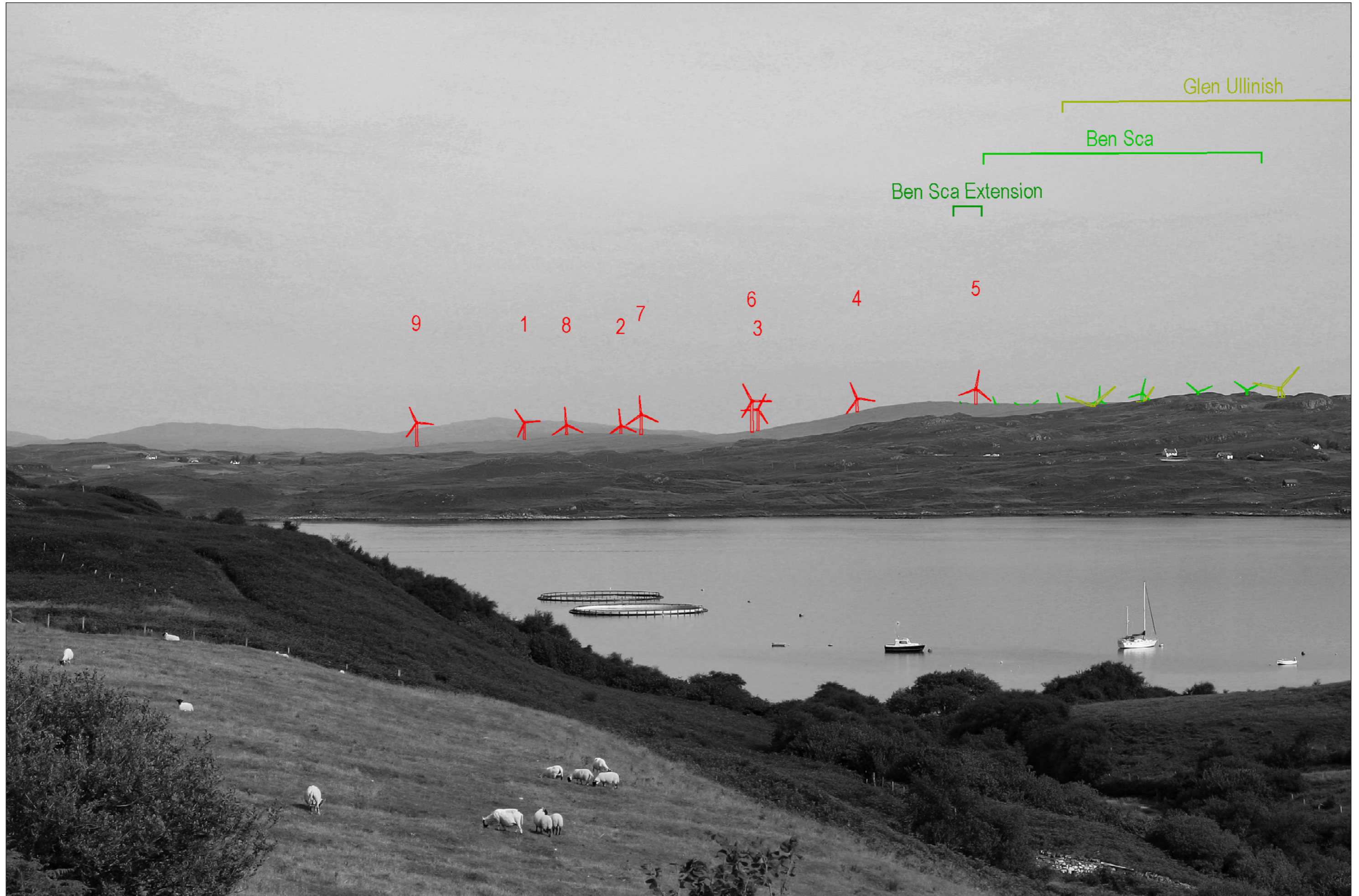
Viewpoint 11: Ardtreck, Minginish - Monochrome Analysis

This image should be viewed at a comfortable arm's length (Approx. 500 mm)