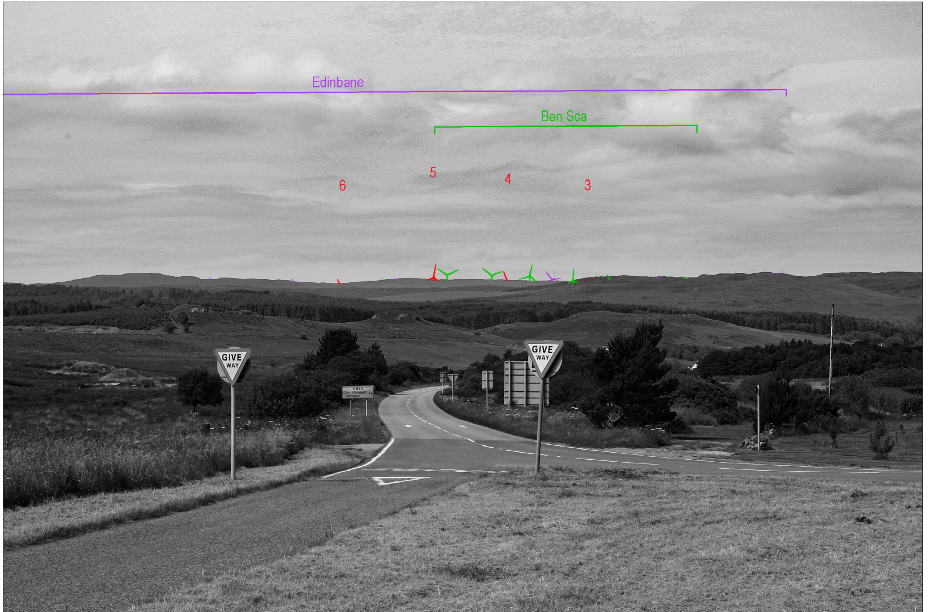
Viewpoint 12: A87 at Borve - Monochrome Analysis

This image should be viewed at a comfortable arm's length (Approx. 500 mm)