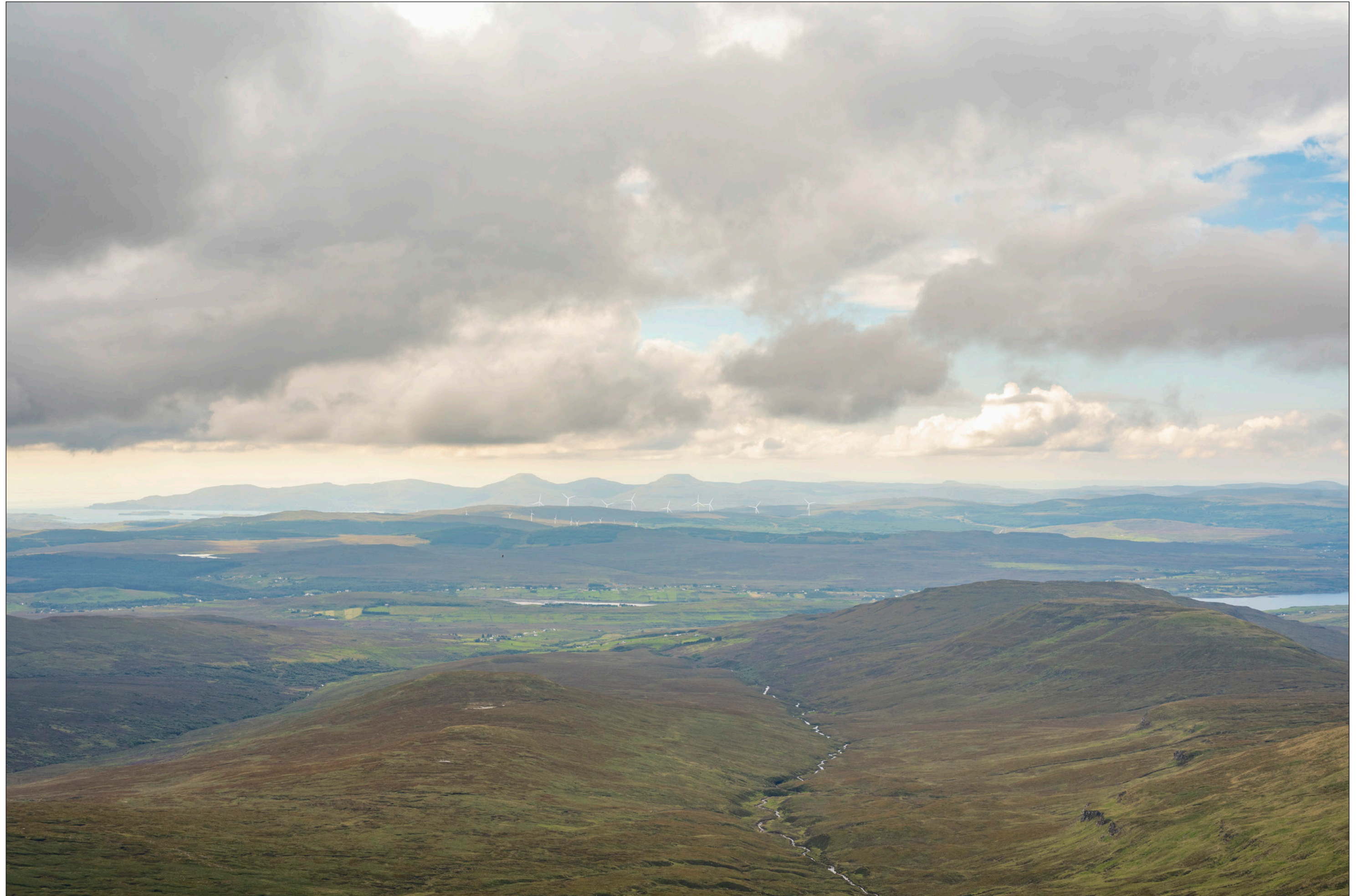
Viewpoint 15: The Storr

When viewed at a comfortable arm's length (approx. 500 mm), this printed image is representative of our detailed central vision, but is not representative of scale and distance.