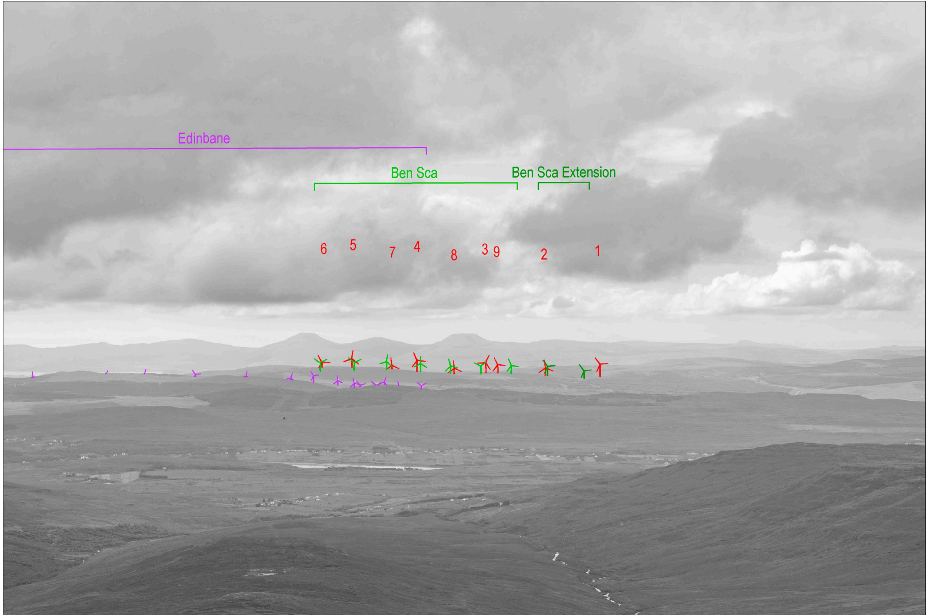
Viewpoint 15: The Storr - Monochrome Analysis

This image should be viewed at a comfortable arm's length (Approx. 500 mm)