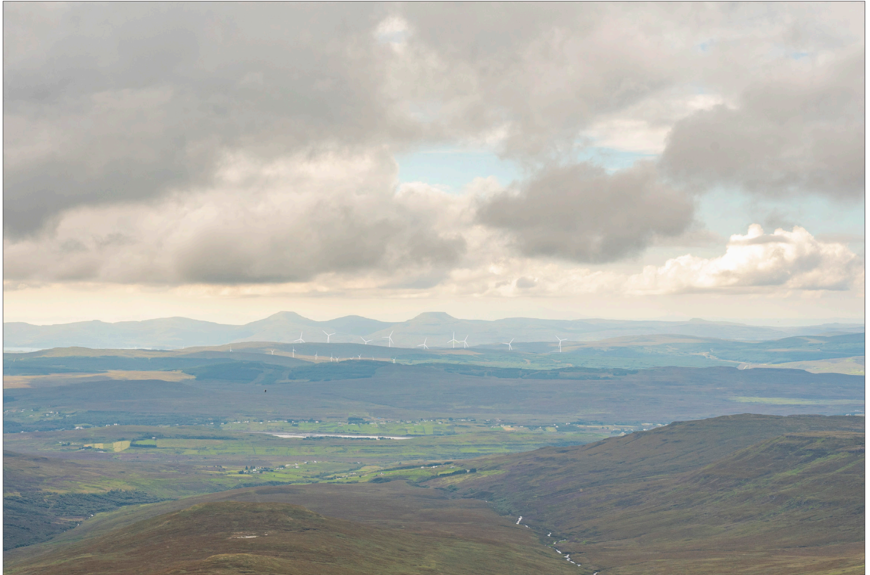
Viewpoint 15: The Storr

This image should be viewed at a comfortable arm's length (Approx. 500 mm)