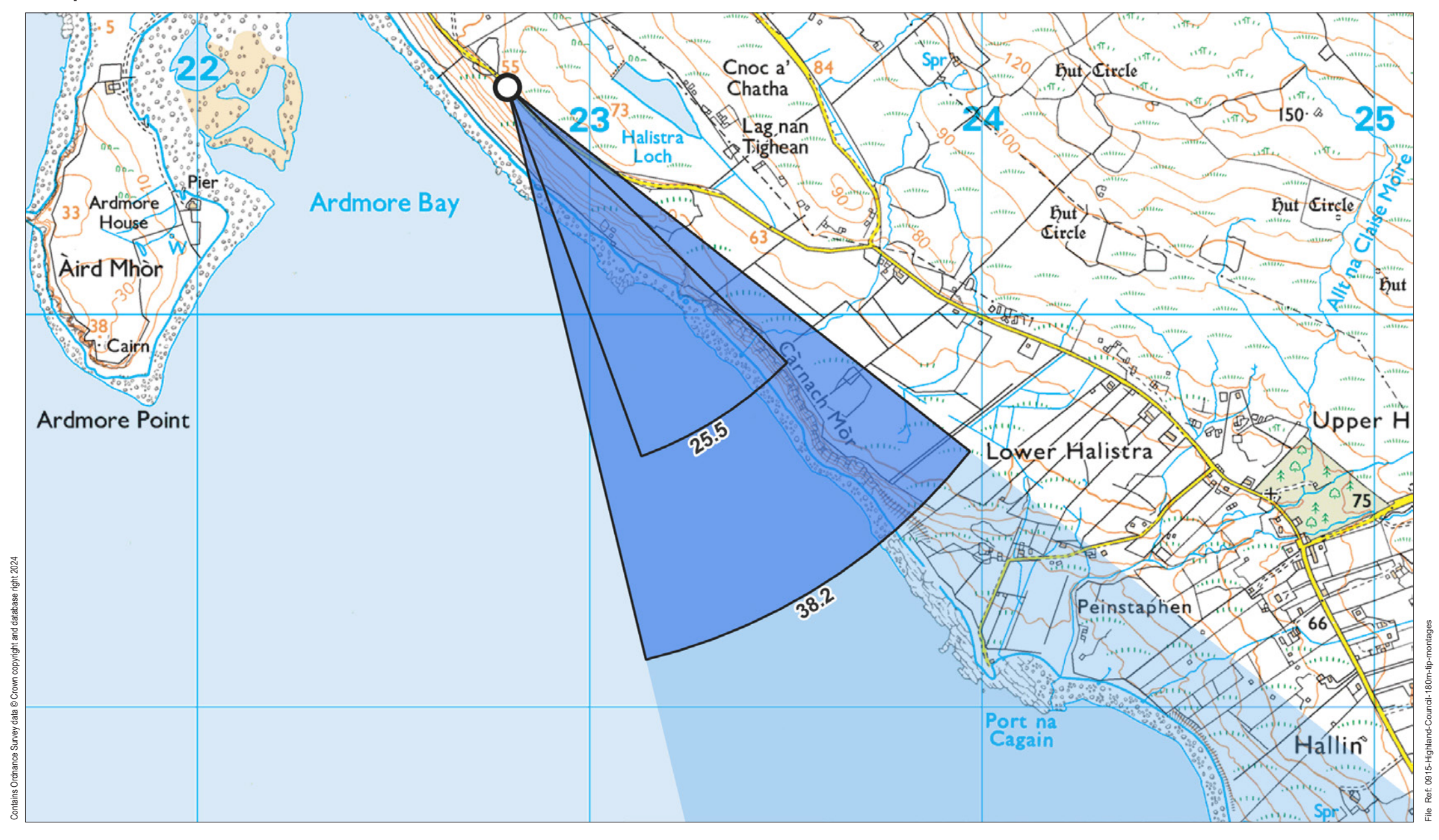
Viewpoint 13: Ardmore, Waternish

Grid Ref: 122790, 860579 Distance to nearest visible turbines: 14025m AOD: 59.6m