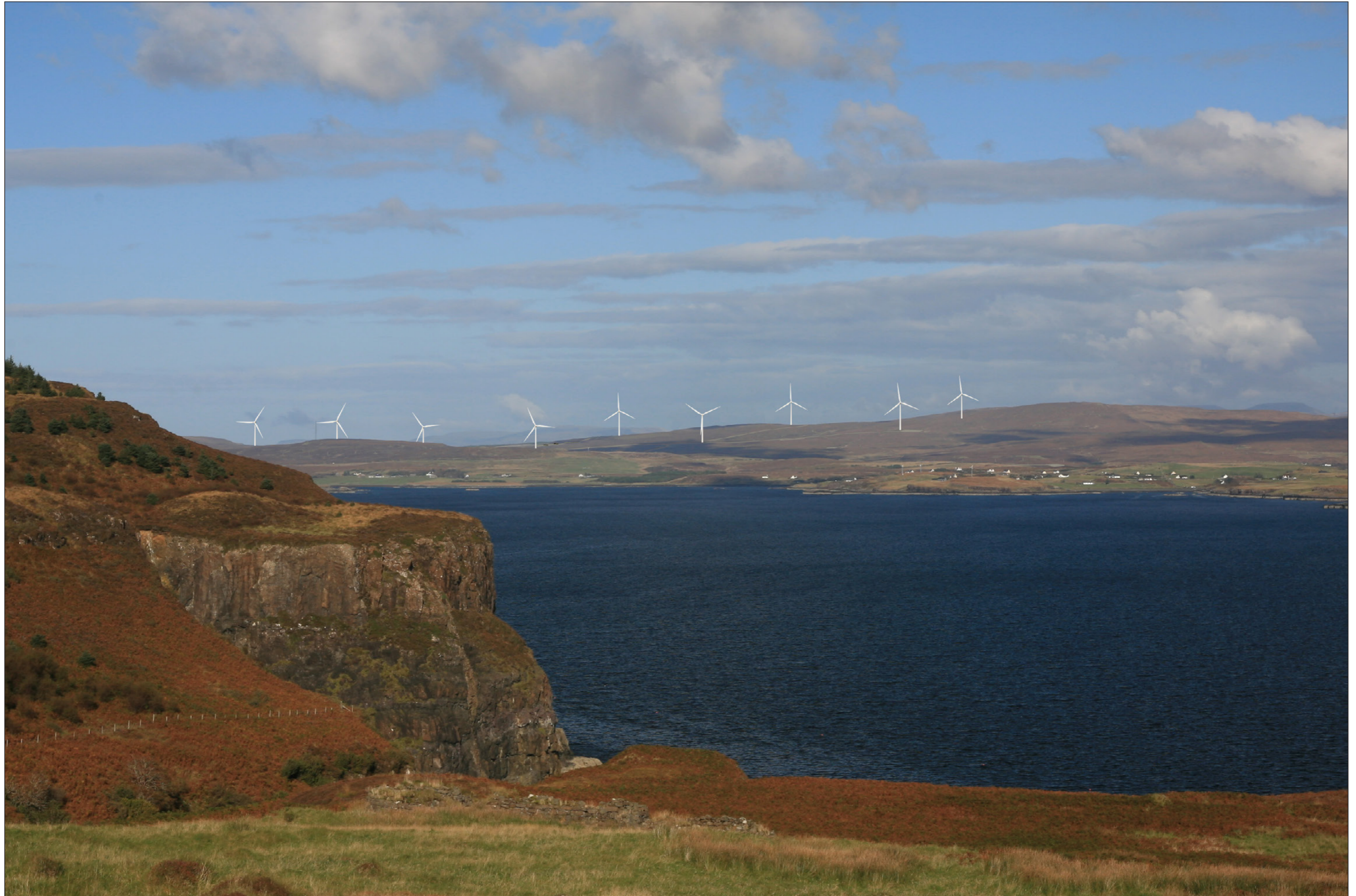
Viewpoint 20: Idrigill Core Path

This image should be viewed at a comfortable arm's length (Approx. 500 mm)