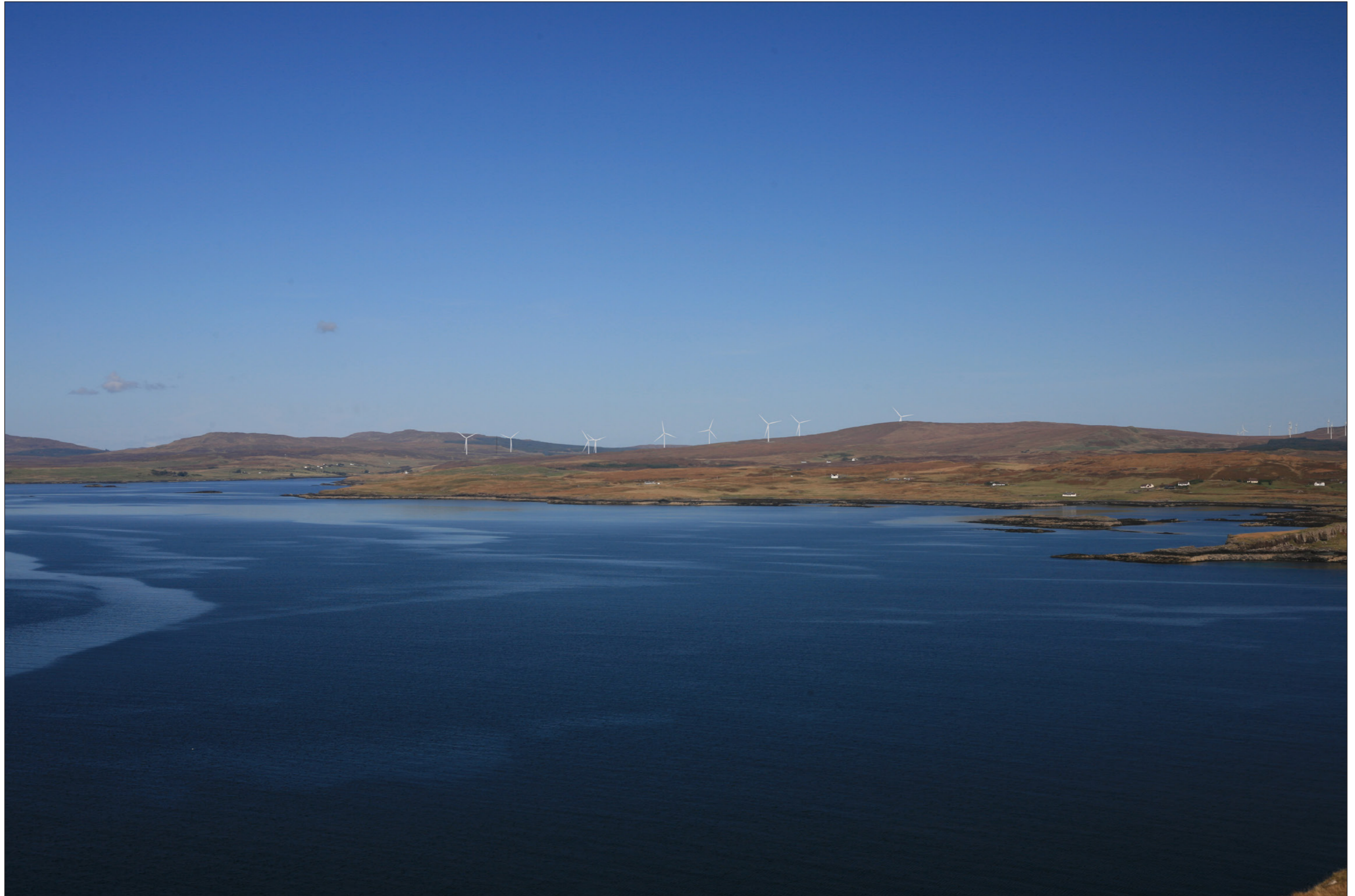
Viewpoint 21: Oronsay

When viewed at a comfortable arm's length (approx. 500 mm), this printed image is representative of our detailed central vision, but is not representative of scale and distance.