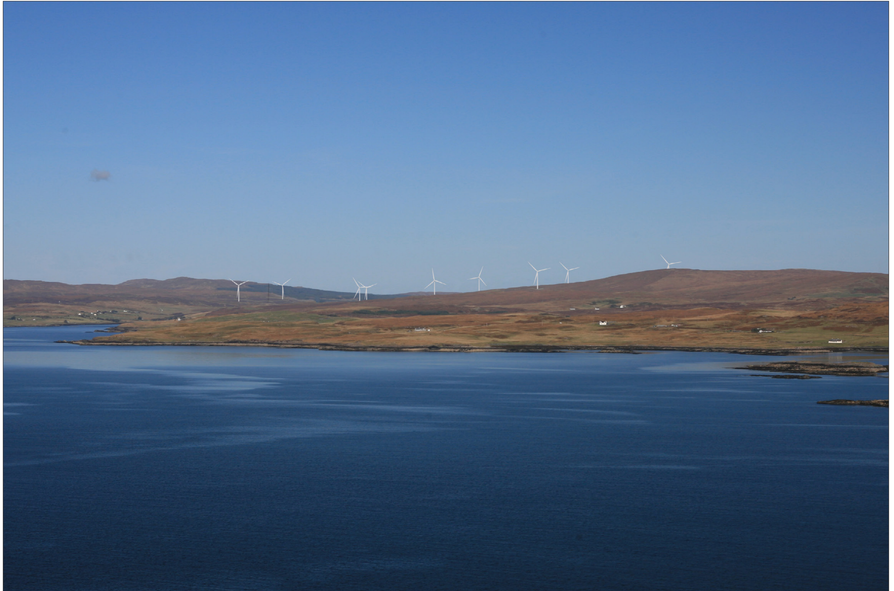
Viewpoint 21: Oronsay

This image should be viewed at a comfortable arm's length (Approx. 500 mm)