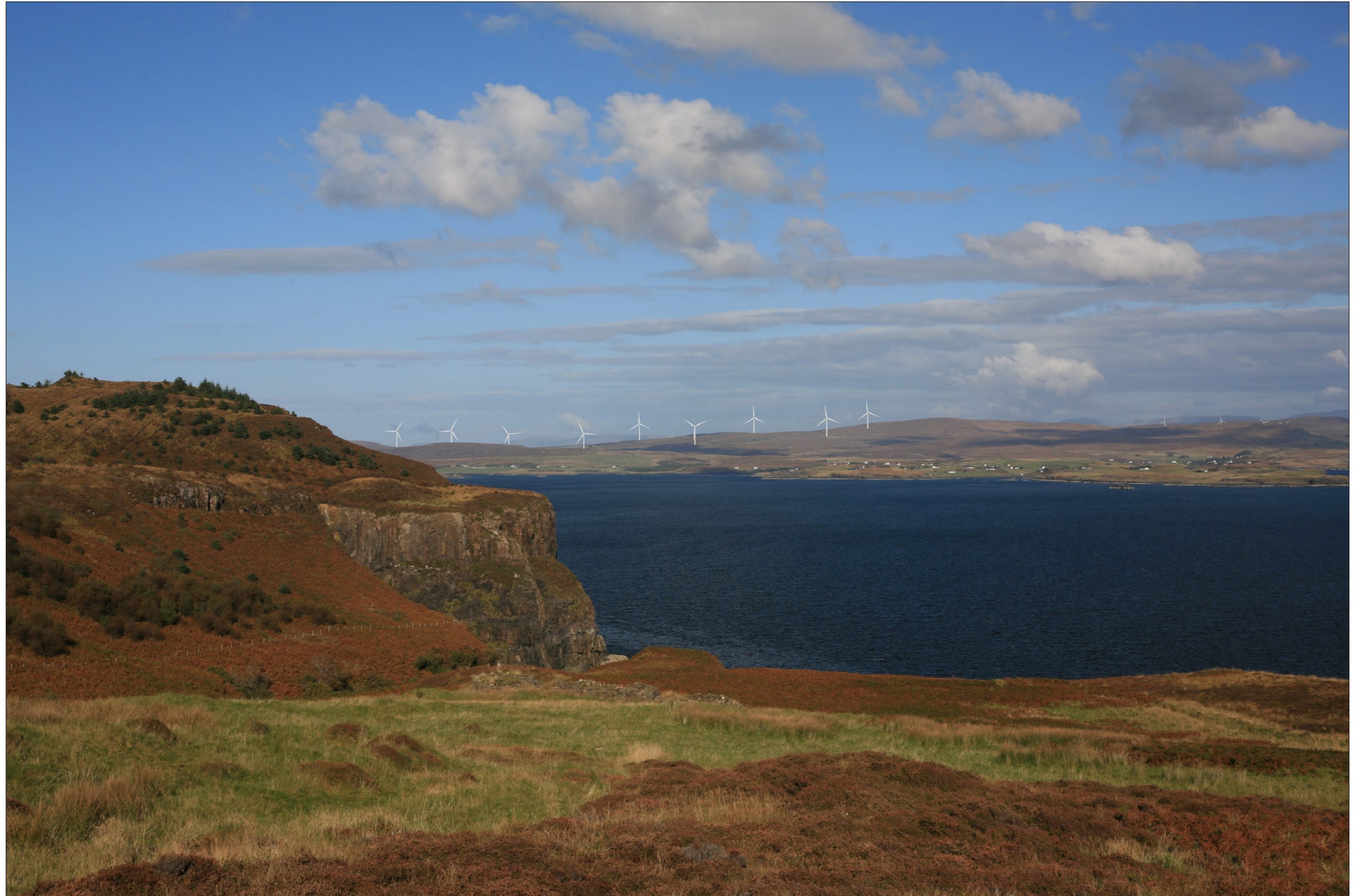
Viewpoint 20: Idrigill Core Path

When viewed at a comfortable arm's length (approx. 500 mm), this printed image is representative of our detailed central vision, but is not representative of scale and distance.