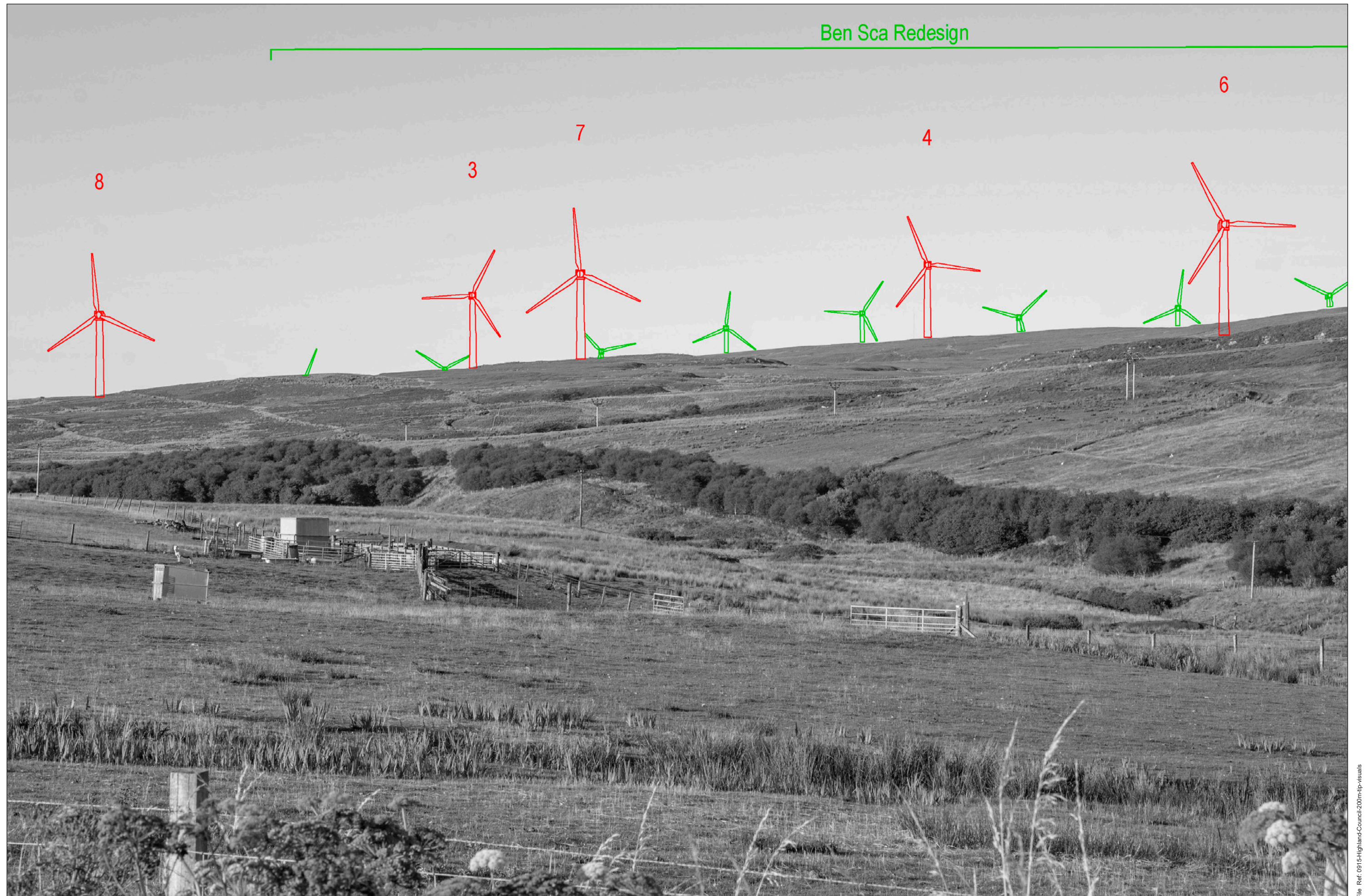
Viewpoint 2: A863 at Feorlig - Monochrome Analysis

This image should be viewed at a comfortable arm's length (Approx. 500 mm)