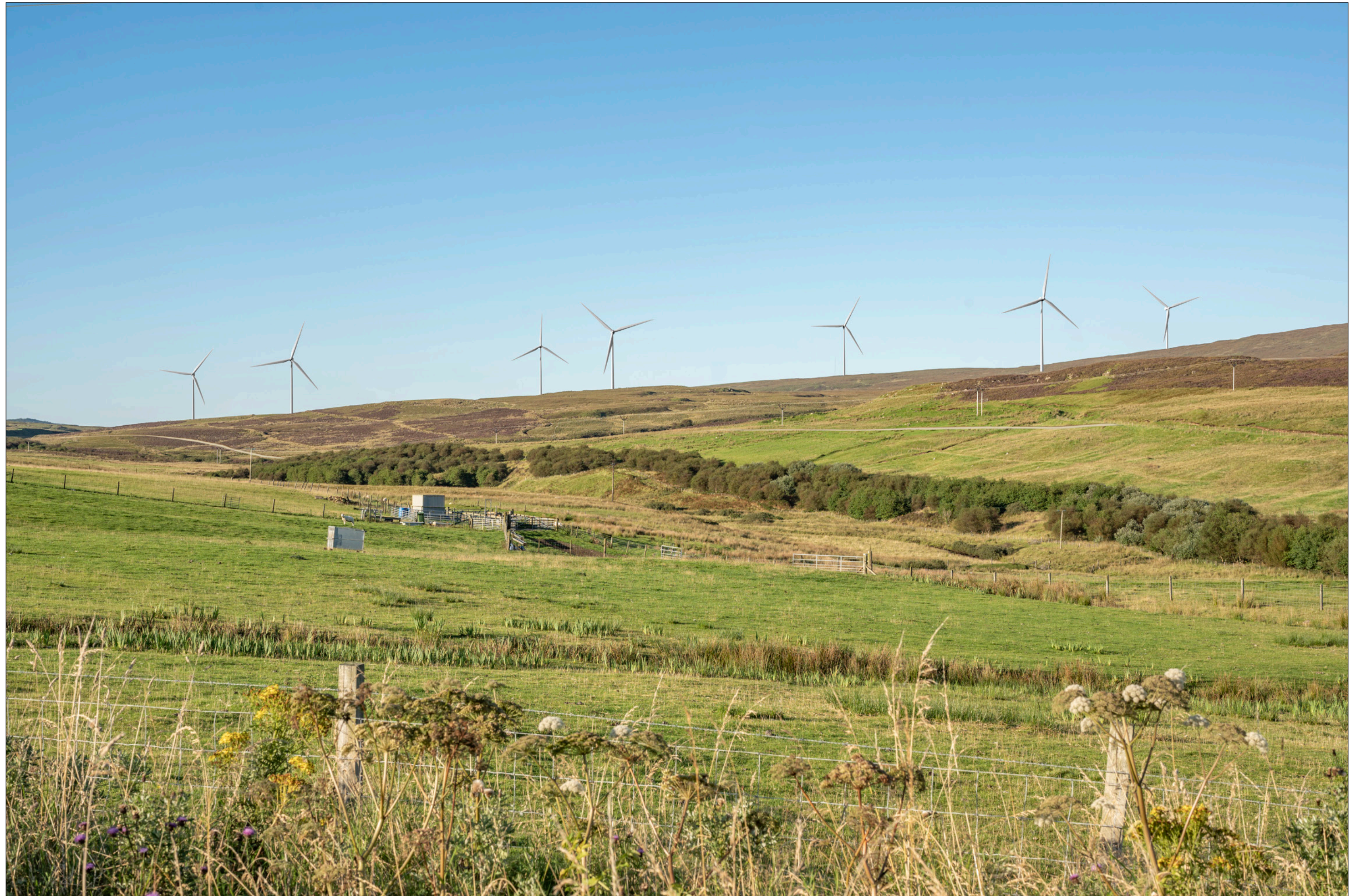
Viewpoint 2: A863 at Feorlig

When viewed at a comfortable arm's length (approx. 500 mm), this printed image is representative of our detailed central vision, but is not representative of scale and distance.