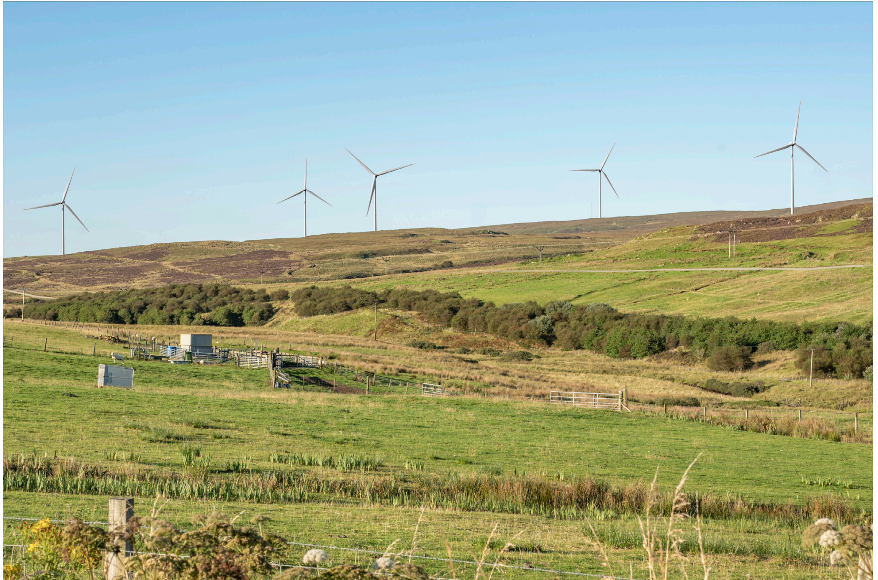
Viewpoint 2: A863 at Feorlig

This image should be viewed at a comfortable arm's length (Approx. 500 mm)