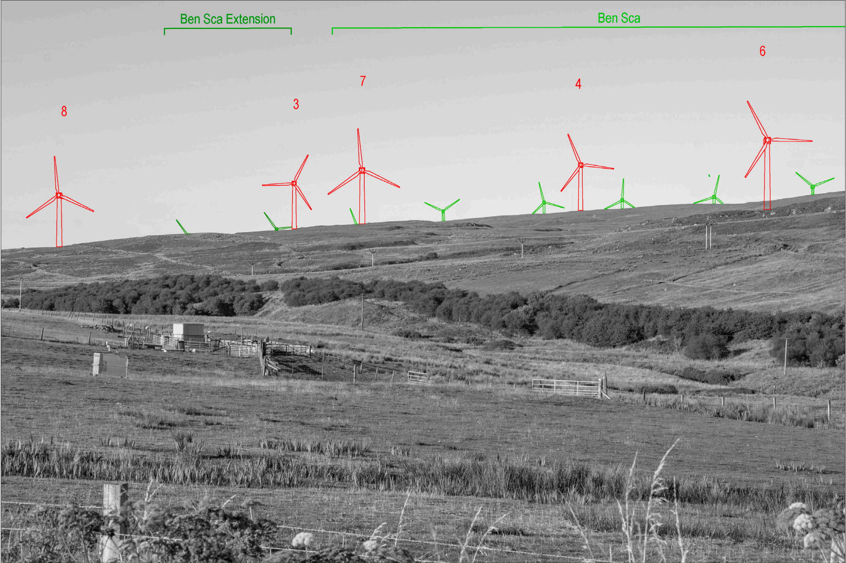
Viewpoint 2: A863 at Feorlig - Monochrome Analysis

This image should be viewed at a comfortable arm's length (Approx. 500 mm)