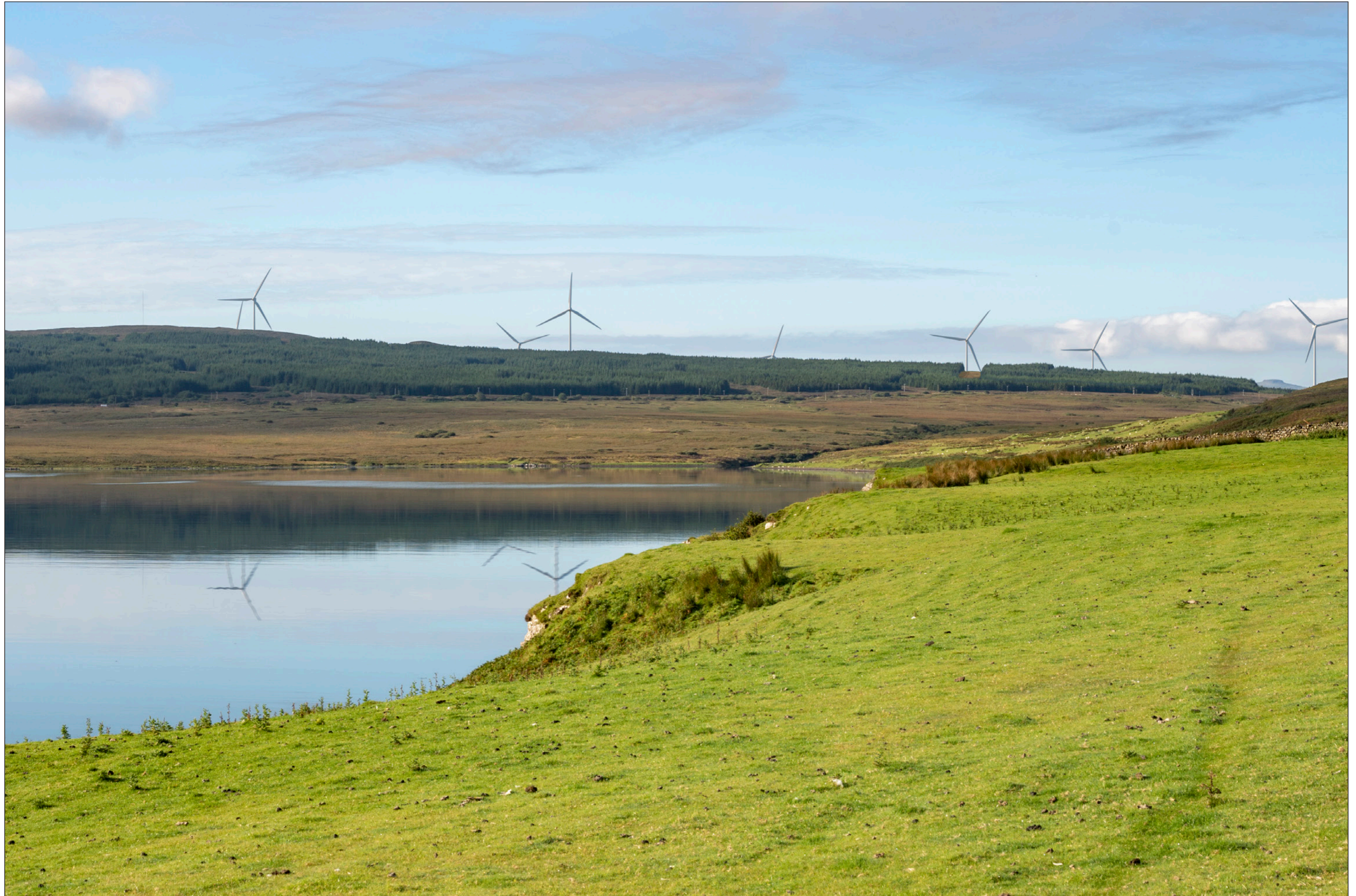
Viewpoint 7: Minor Road to Greshornish

This image should be viewed at a comfortable arm's length (Approx. 500 mm)