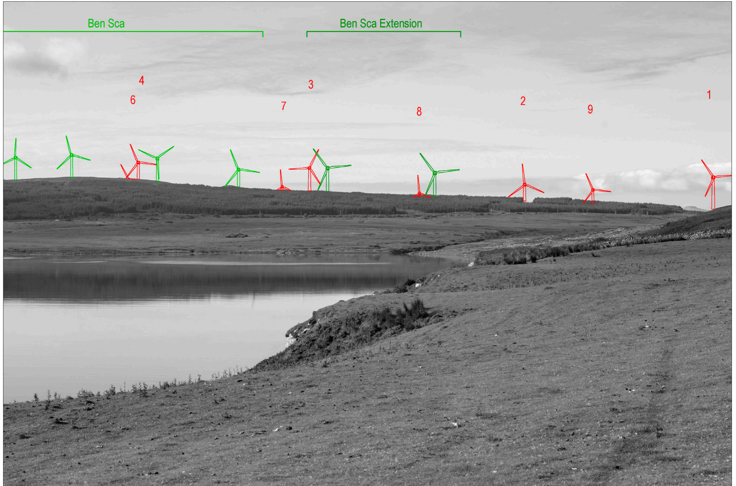
Viewpoint 7: Minor Road to Greshornish - Monochrome Analysis

This image should be viewed at a comfortable arm's length (Approx. 500 mm)