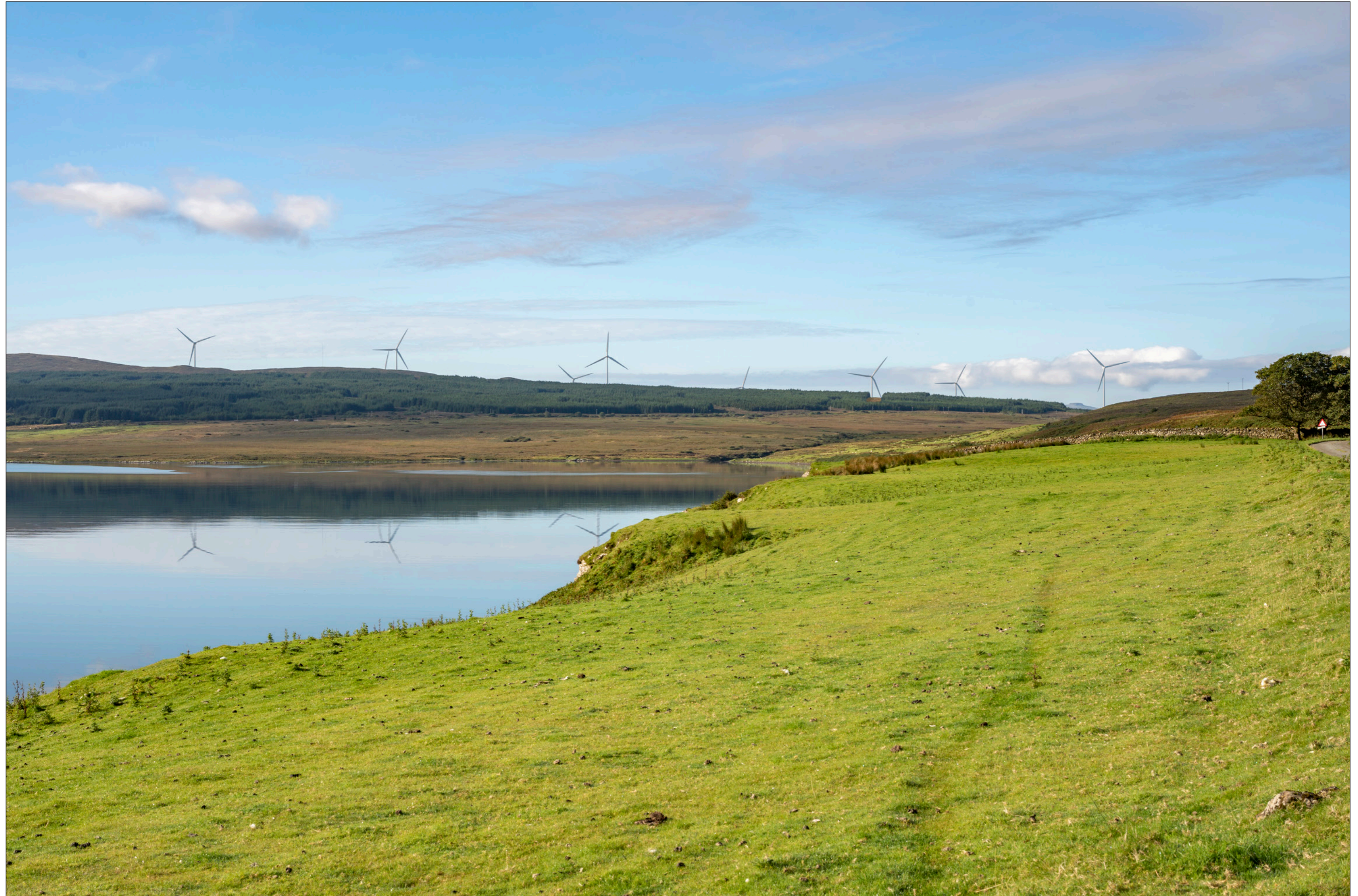
Viewpoint 7: Minor Road to Greshornish

When viewed at a comfortable arm's length (approx. 500 mm), this printed image is representative of our detailed central vision, but is not representative of scale and distance.