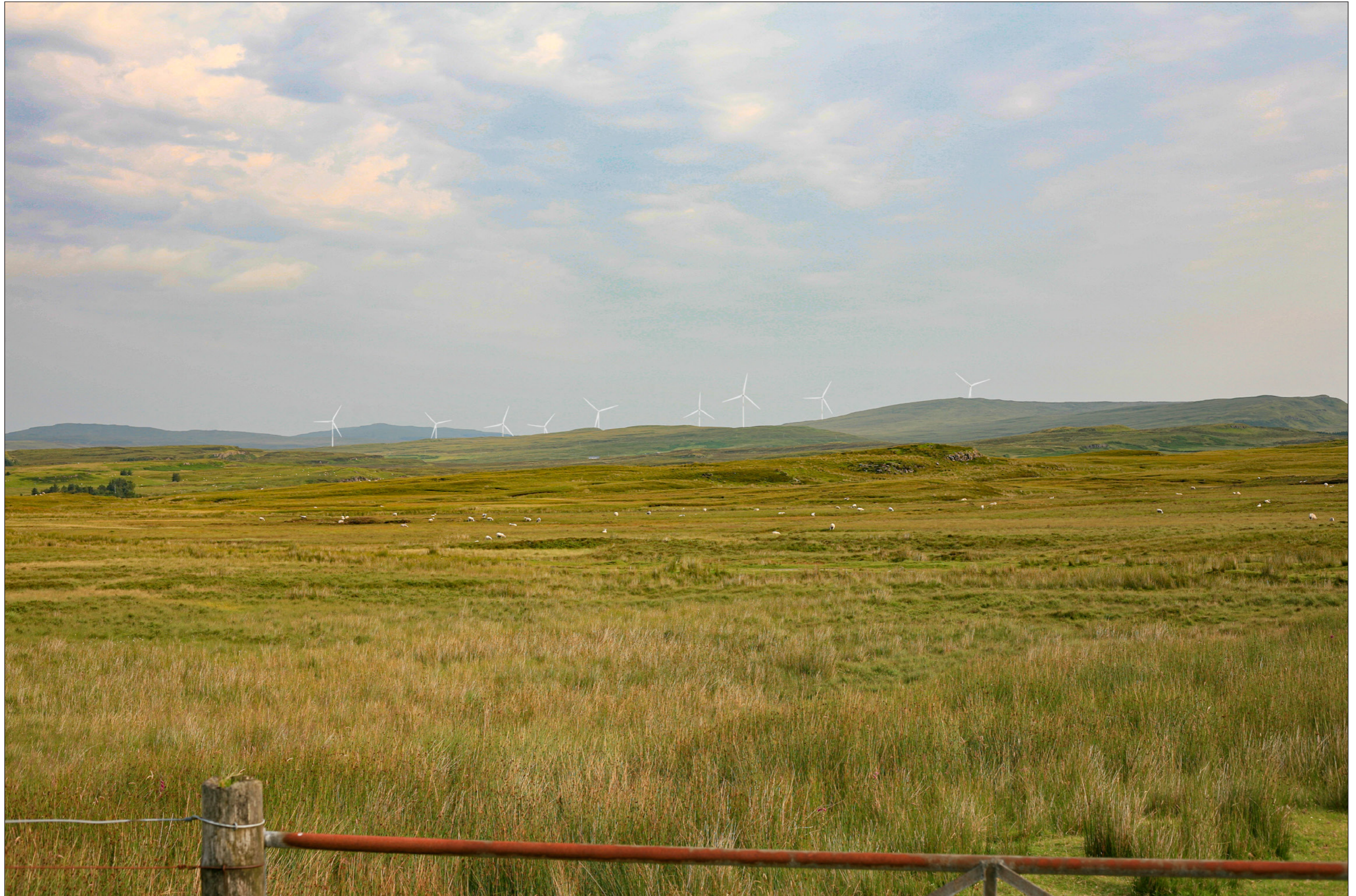
Viewpoint 8: A863 near Gearymore

When viewed at a comfortable arm's length (approx. 500 mm), this printed image is representative of our detailed central vision, but is not representative of scale and distance.