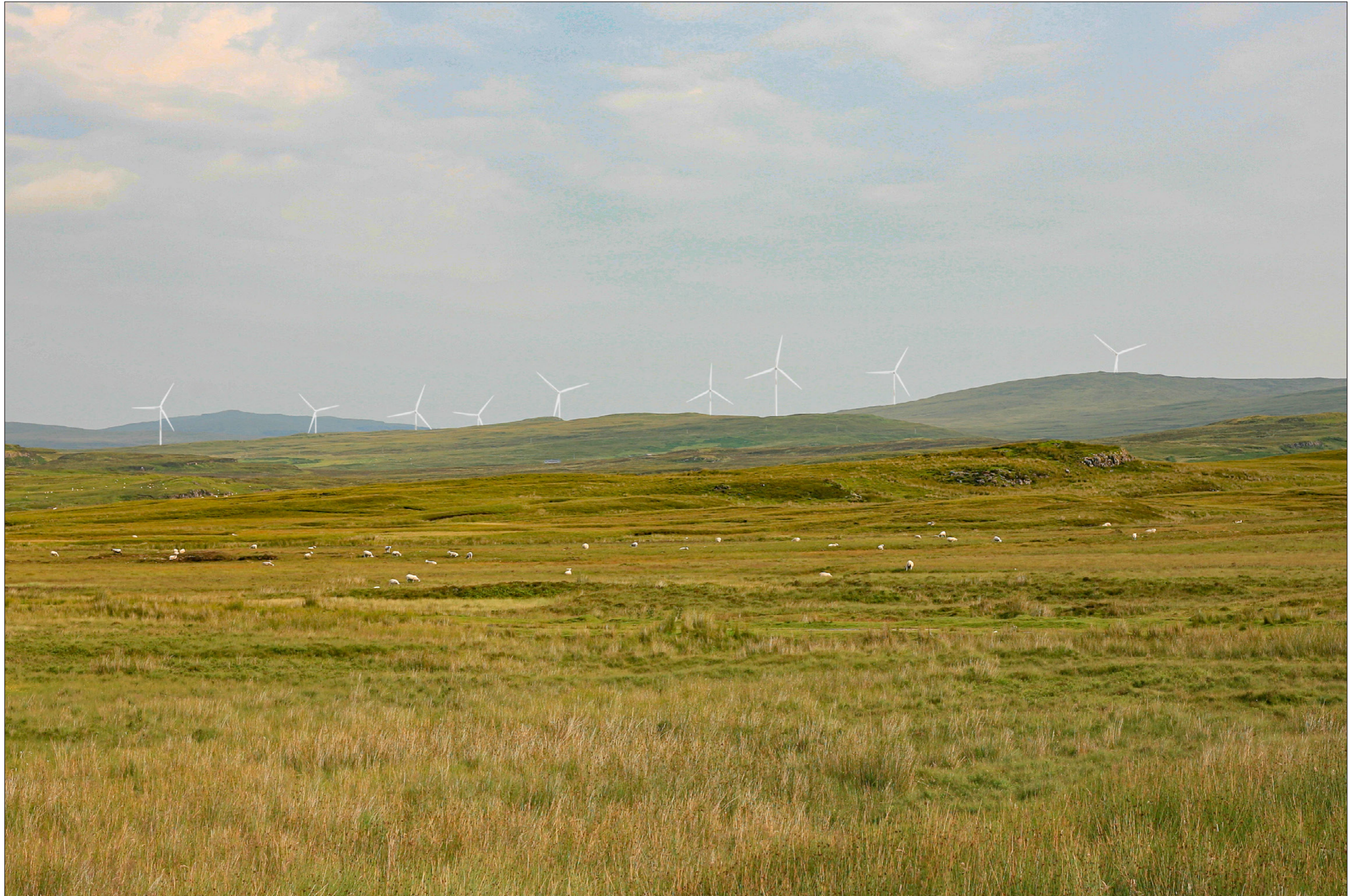
Viewpoint 8: A863 near Gearymore

This image should be viewed at a comfortable arm's length (Approx. 500 mm)