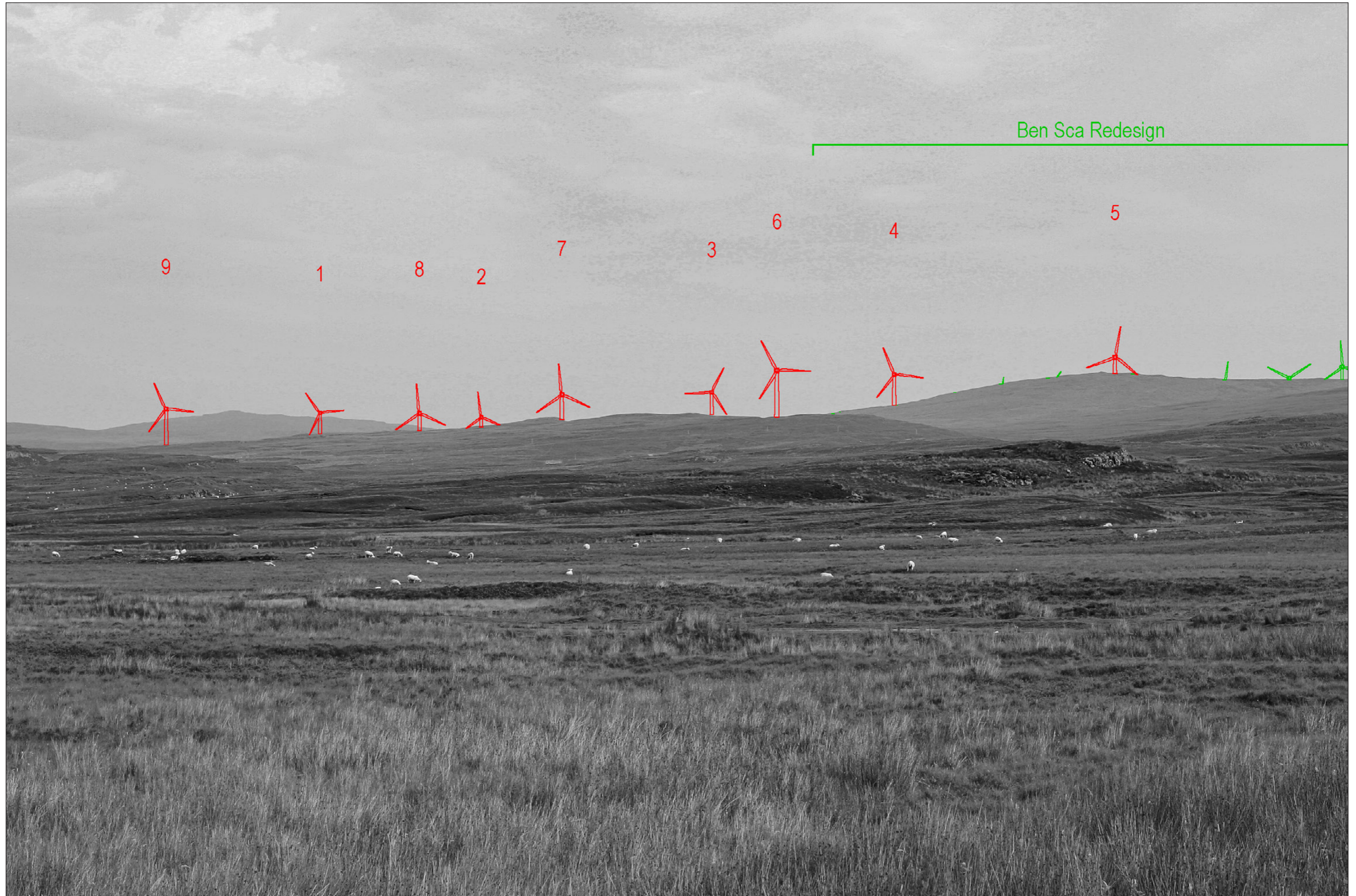
Viewpoint 8: A863 near Gearymore - Monochrome Analysis

This image should be viewed at a comfortable arm's length (Approx. 500 mm)