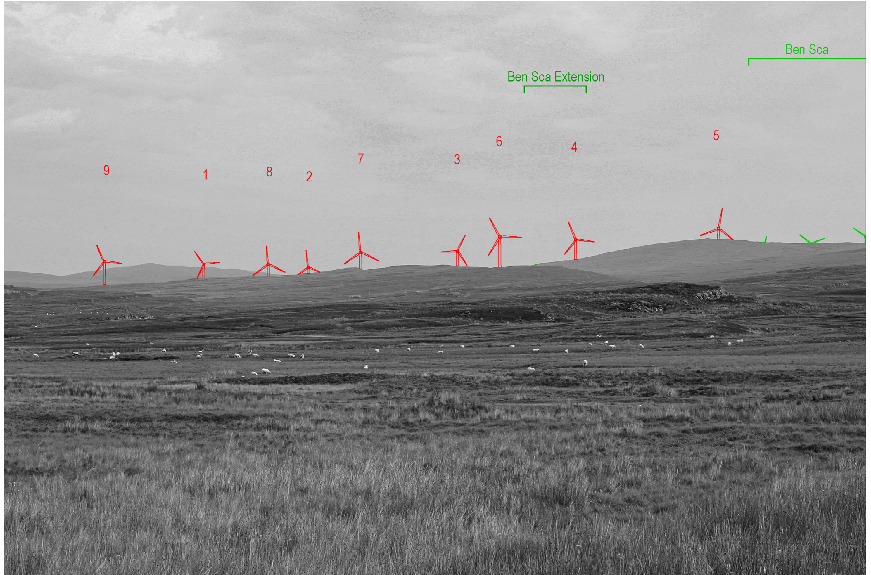
Viewpoint 8: A863 near Gearymore - Monochrome Analysis