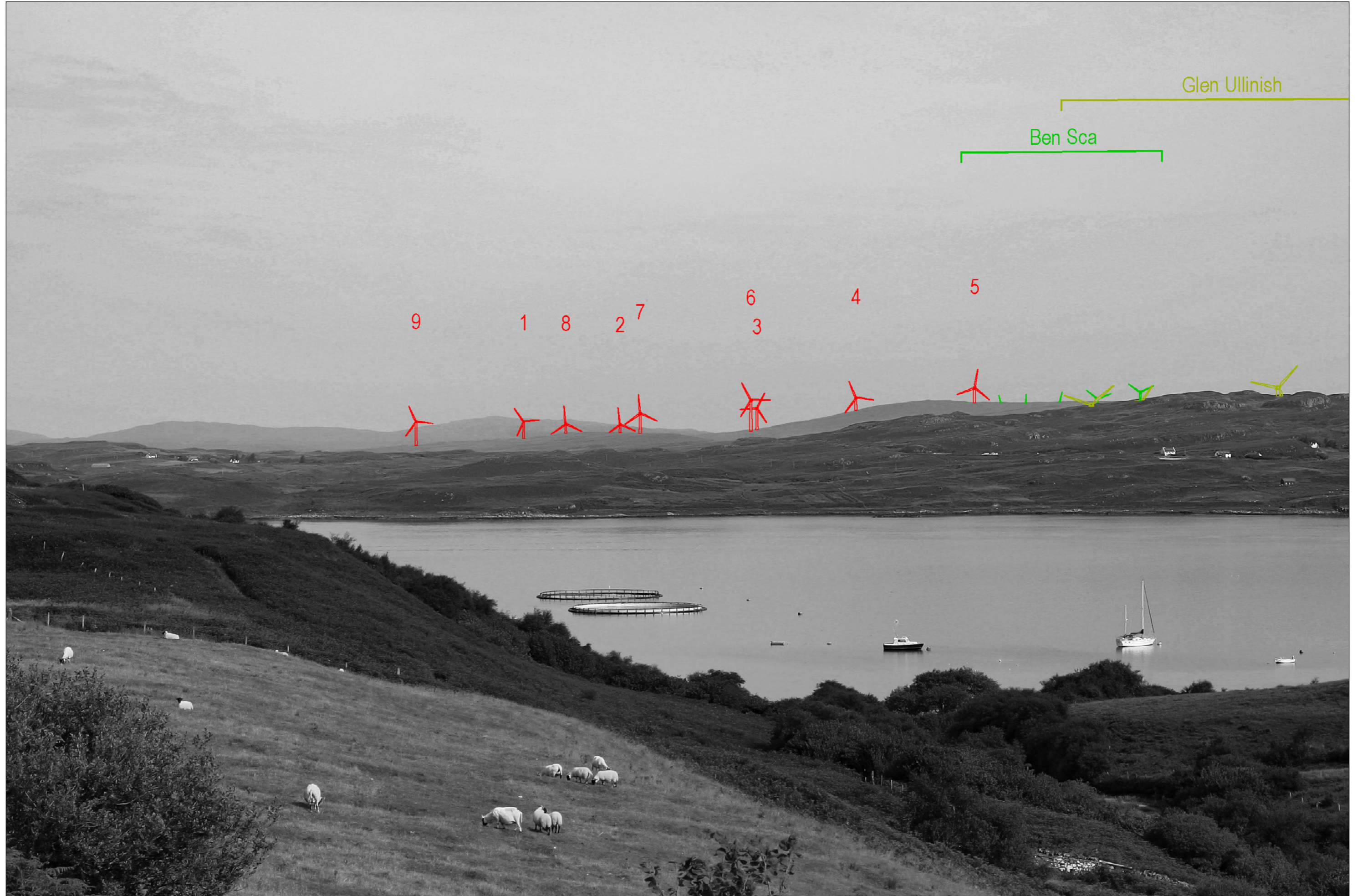
Viewpoint 11: Ardtreck, Minginish - Monochrome Analysis

This image should be viewed at a comfortable arm's length (Approx. 500 mm)