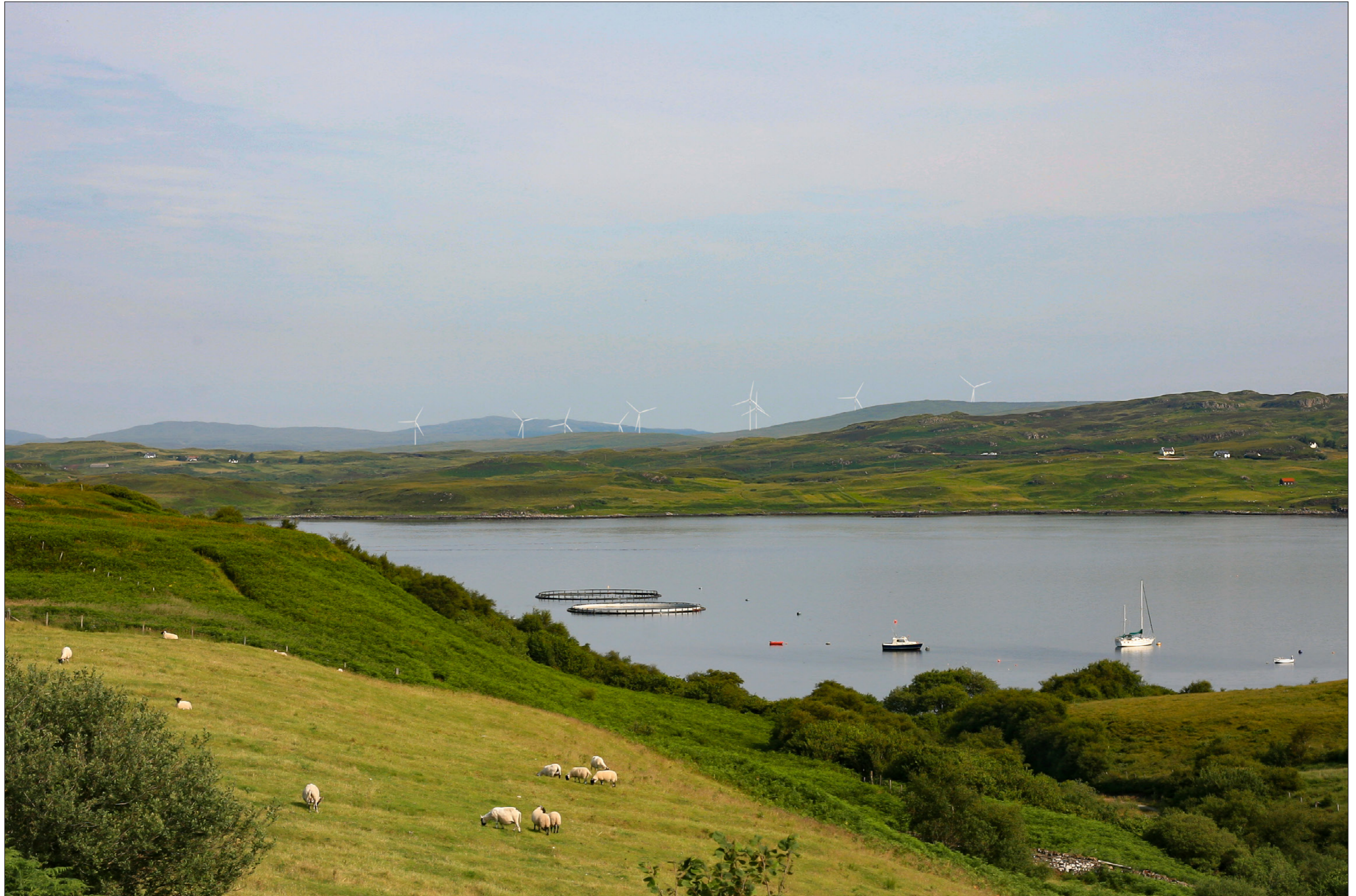
Viewpoint 11: Ardtreck, Minginish

This image should be viewed at a comfortable arm's length (Approx. 500 mm)