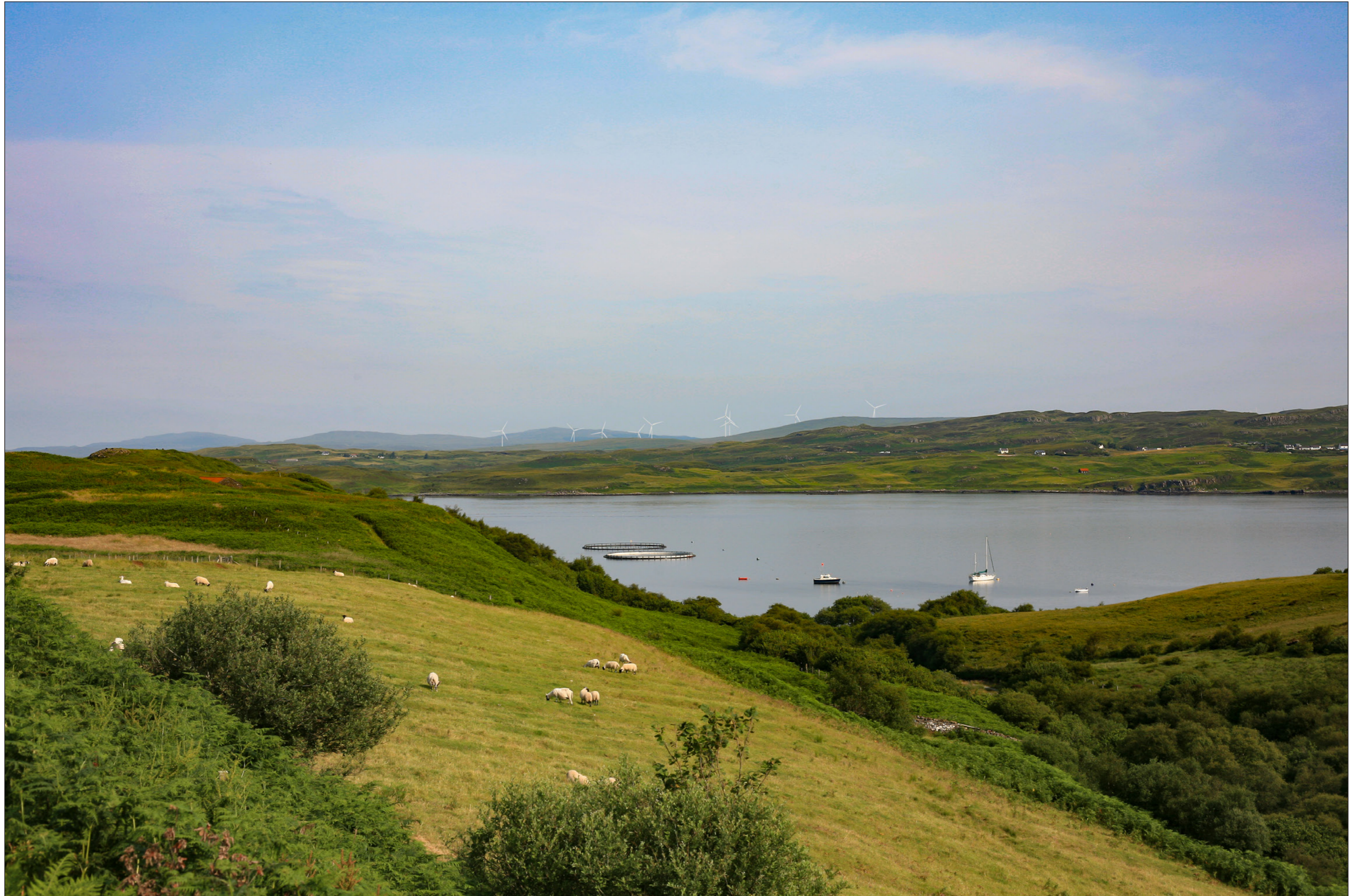
Viewpoint 11: Ardtreck, Minginish

When viewed at a comfortable arm's length (approx. 500 mm), this printed image is representative of our detailed central vision, but is not representative of scale and distance.