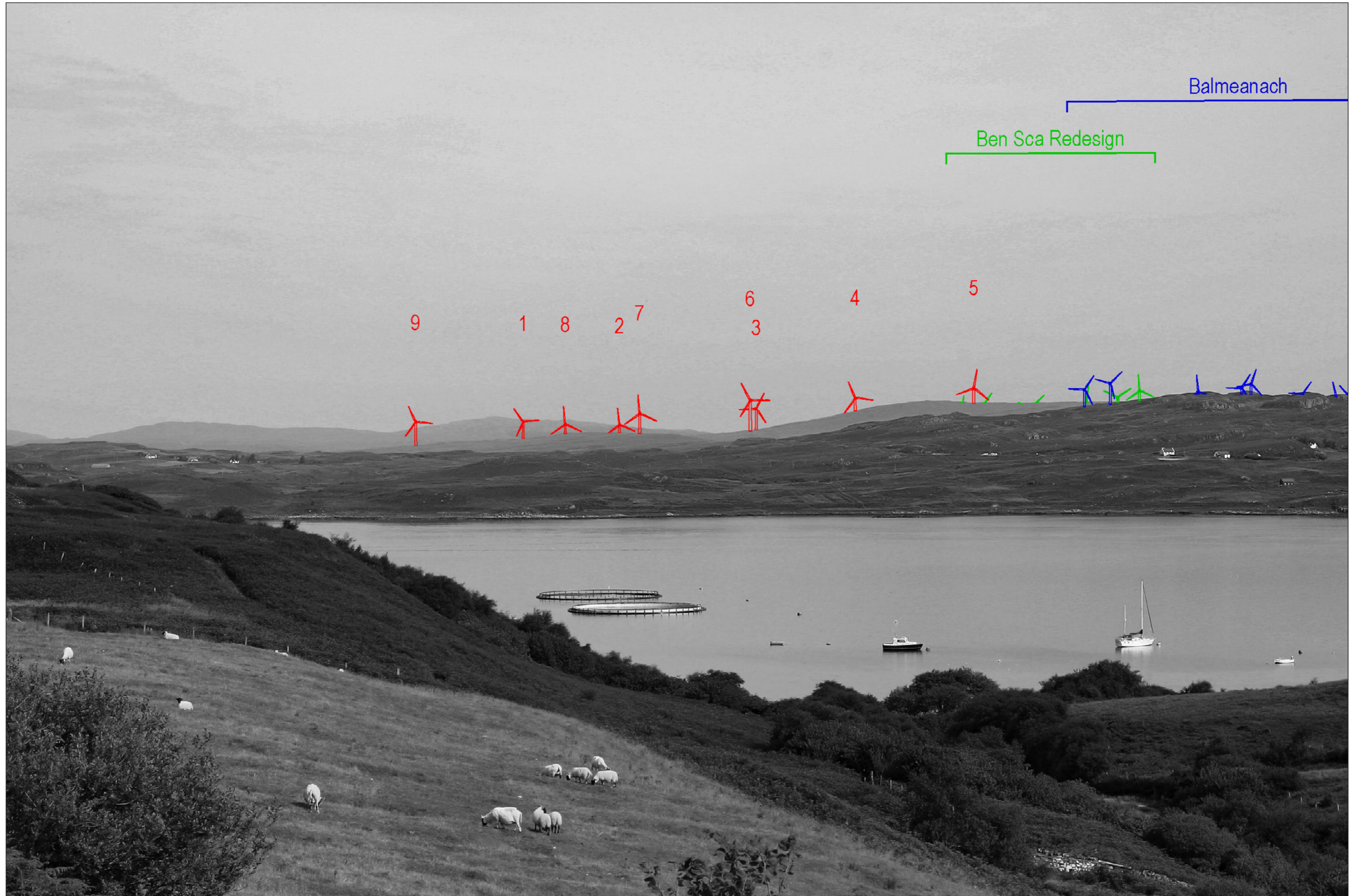
Viewpoint 11: Ardtreck, Minginish - Monochrome Analysis

This image should be viewed at a comfortable arm's length (Approx. 500 mm)