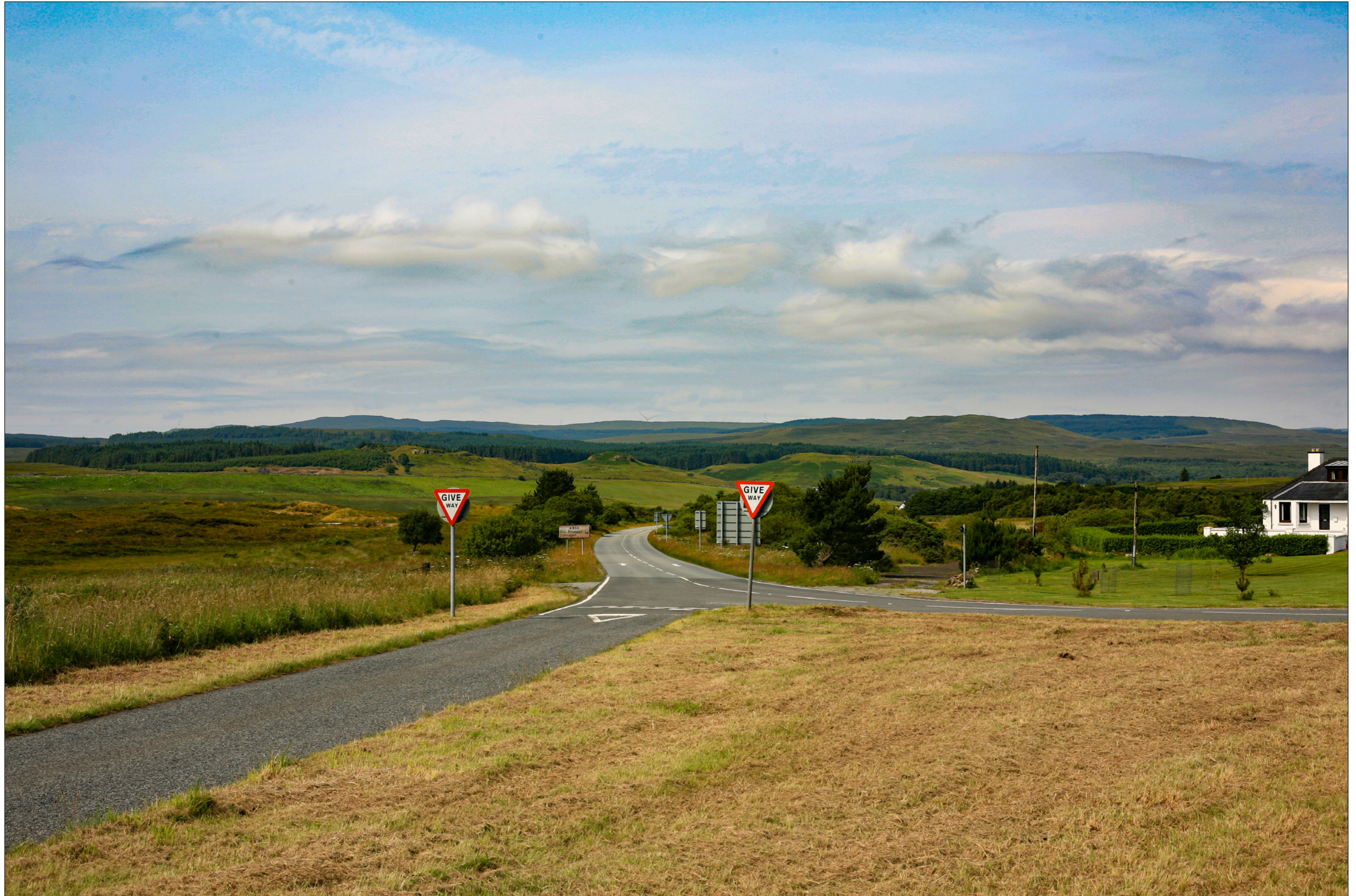
Viewpoint 12: A87 at Borve

When viewed at a comfortable arm's length (approx. 500 mm), this printed image is representative of our detailed central vision, but is not representative of scale and distance.