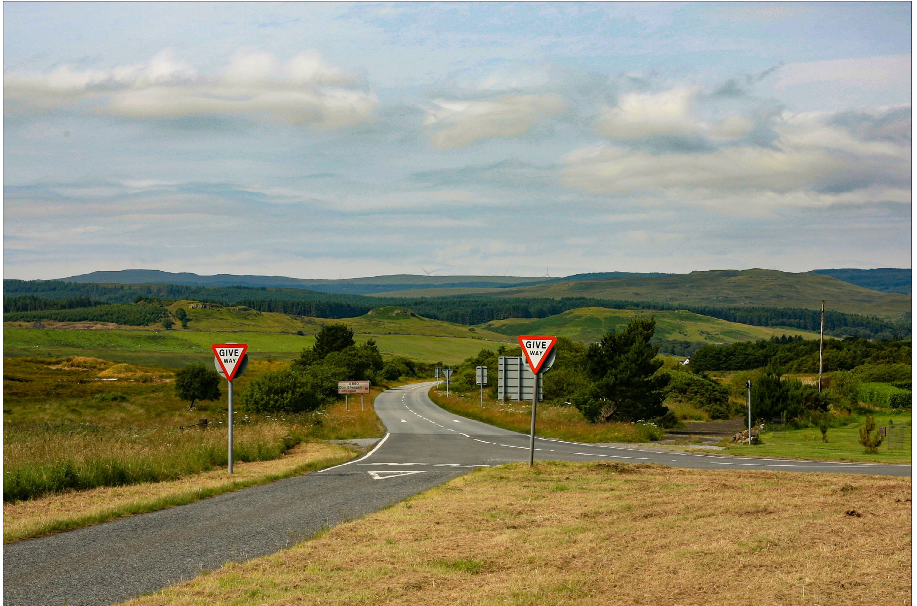
Viewpoint 12: A87 at Borve

This image should be viewed at a comfortable arm's length (Approx. 500 mm)