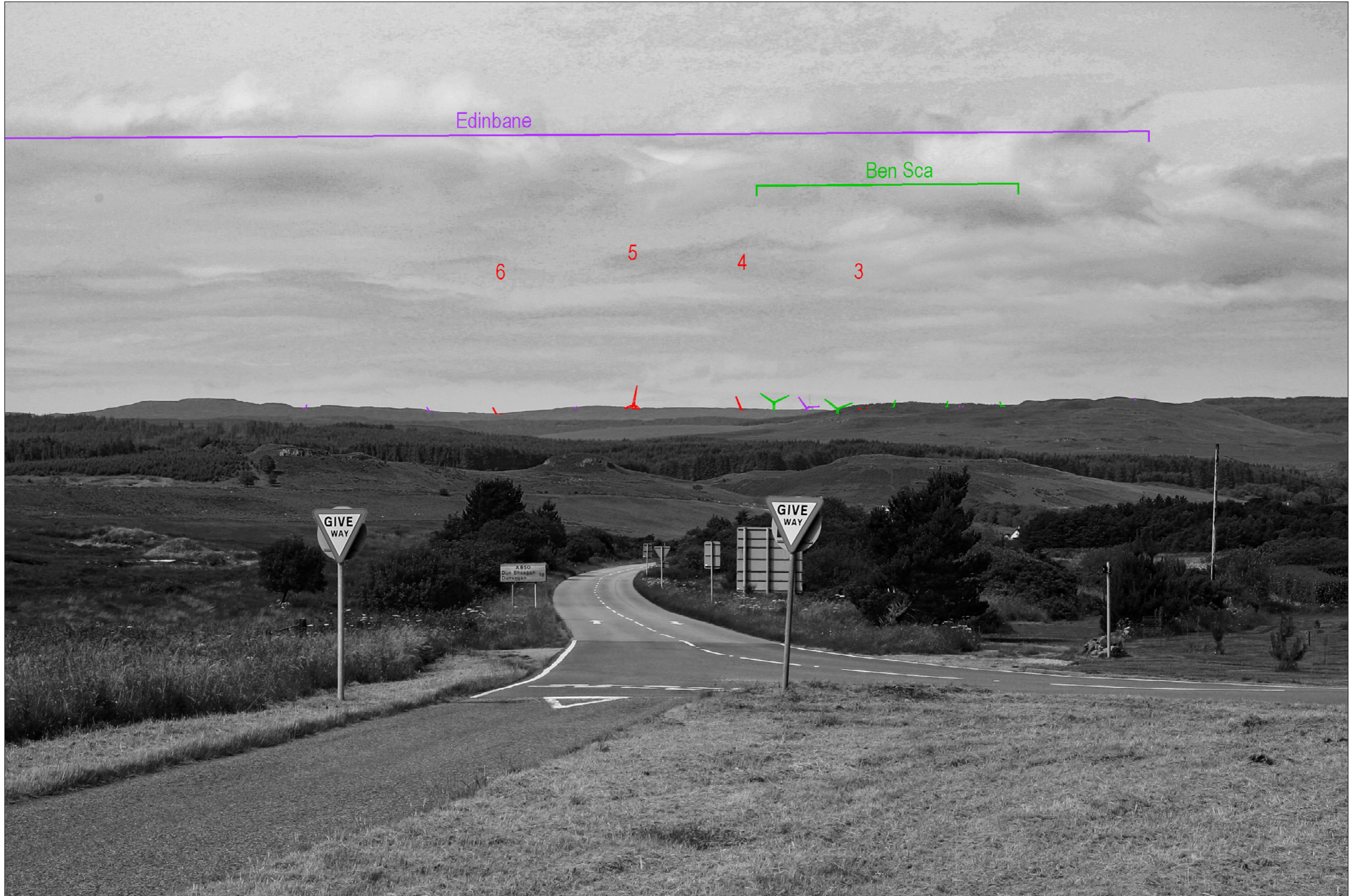
Viewpoint 12: A87 at Borve - Monochrome Analysis

This image should be viewed at a comfortable arm's length (Approx. 500 mm)