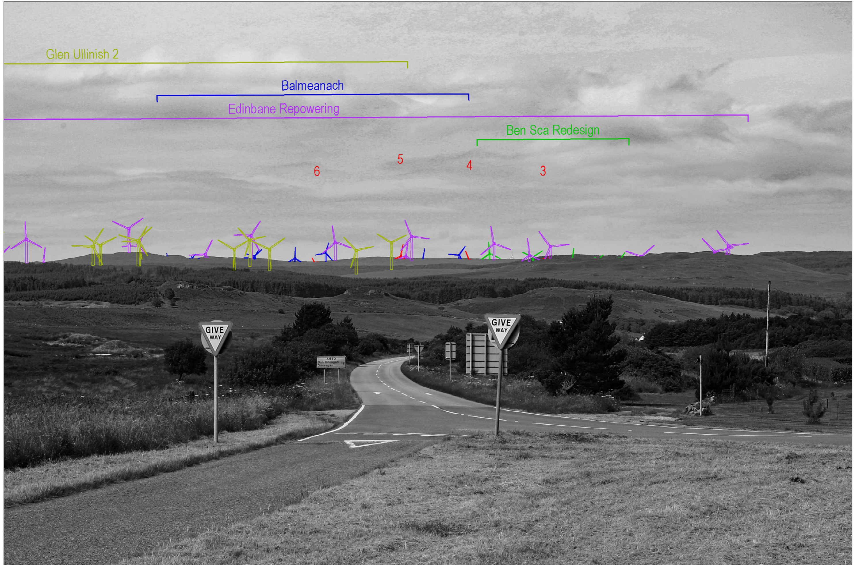
Viewpoint 12: A87 at Borve - Monochrome Analysis

This image should be viewed at a comfortable arm's length (Approx. 500 mm)