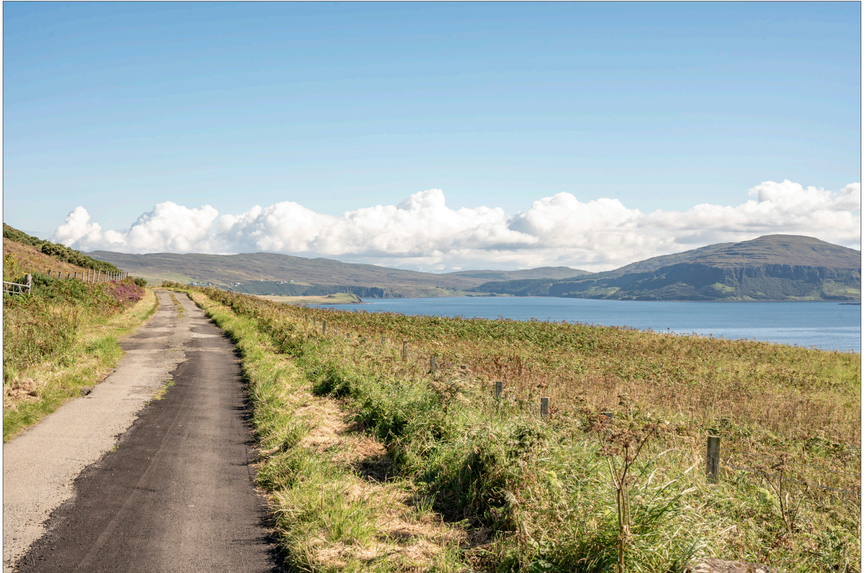
Viewpoint 13: Ardmore, Waternish

When viewed at a comfortable arm's length (approx. 500 mm), this printed image is representative of our detailed central vision, but is not representative of scale and distance.