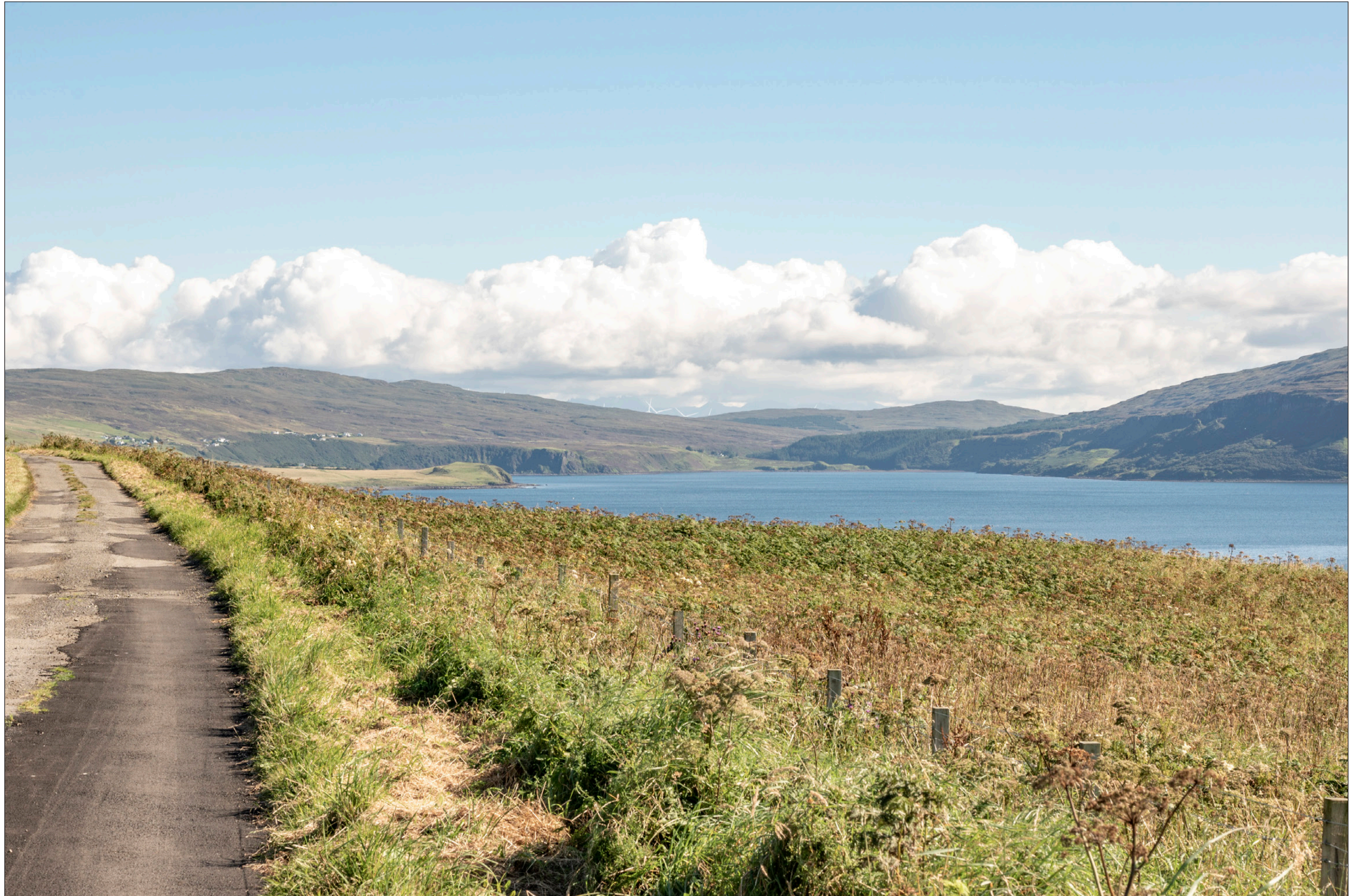
Viewpoint 13: Ardmore, Waternish

This image should be viewed at a comfortable arm's length (Approx. 500 mm)