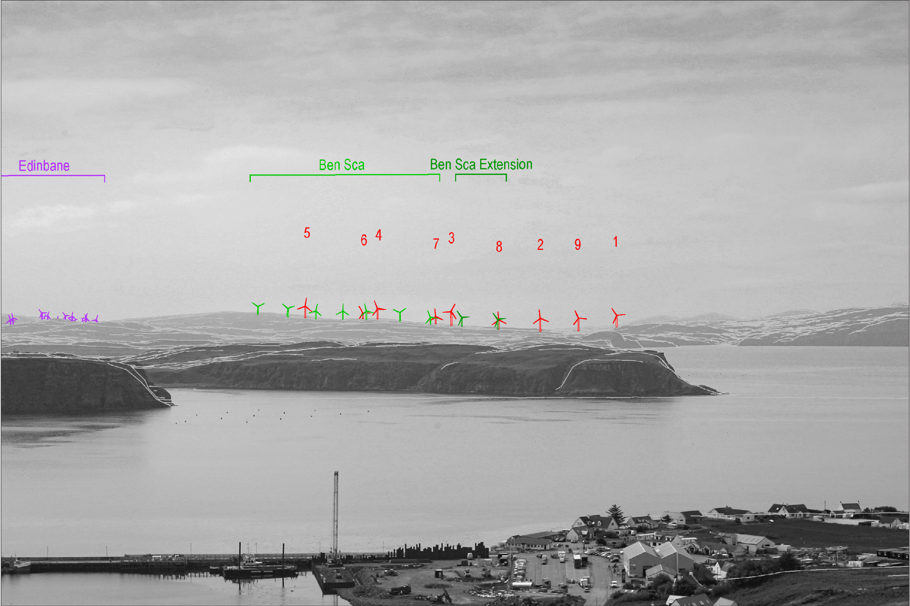
Viewpoint 14: Minor road above Uig - Monochrome Analysis

This image should be viewed at a comfortable arm's length (Approx. 500 mm)