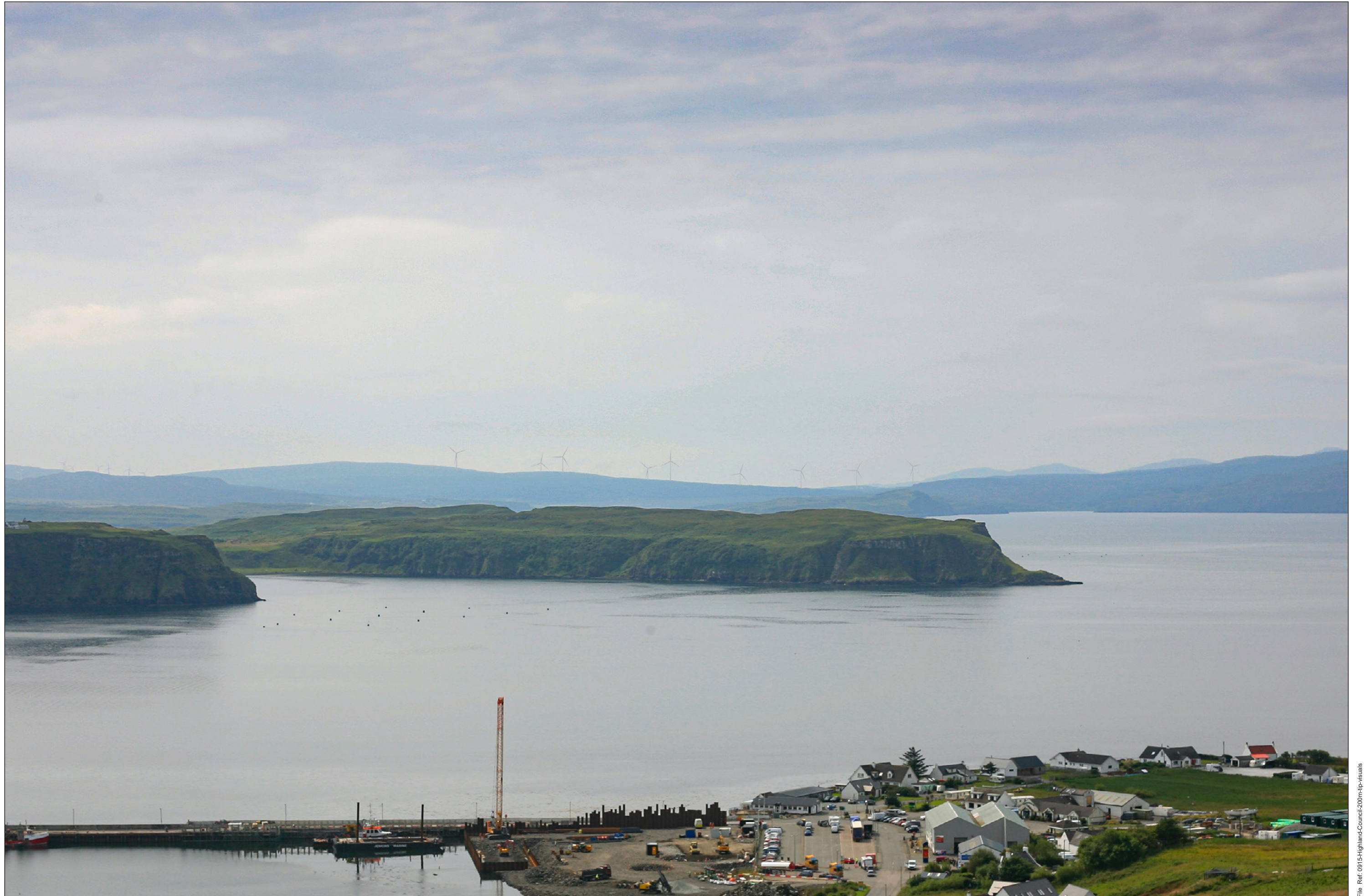
Viewpoint 14: Minor road above Uig

This image should be viewed at a comfortable arm's length (Approx. 500 mm)