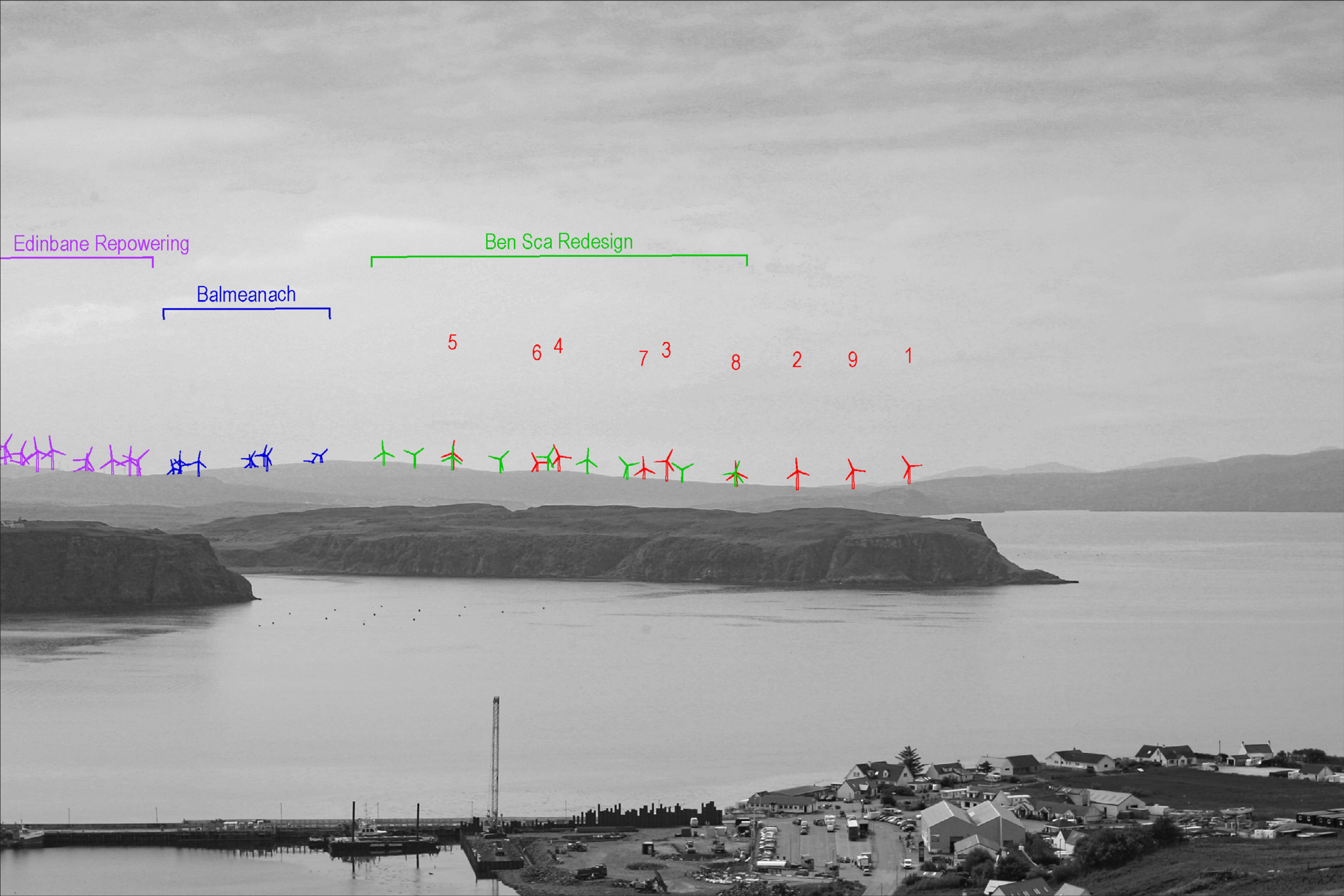
Viewpoint 14: Minor road above Uig - Monochrome Analysis

This image should be viewed at a comfortable arm's length (Approx. 500 mm)