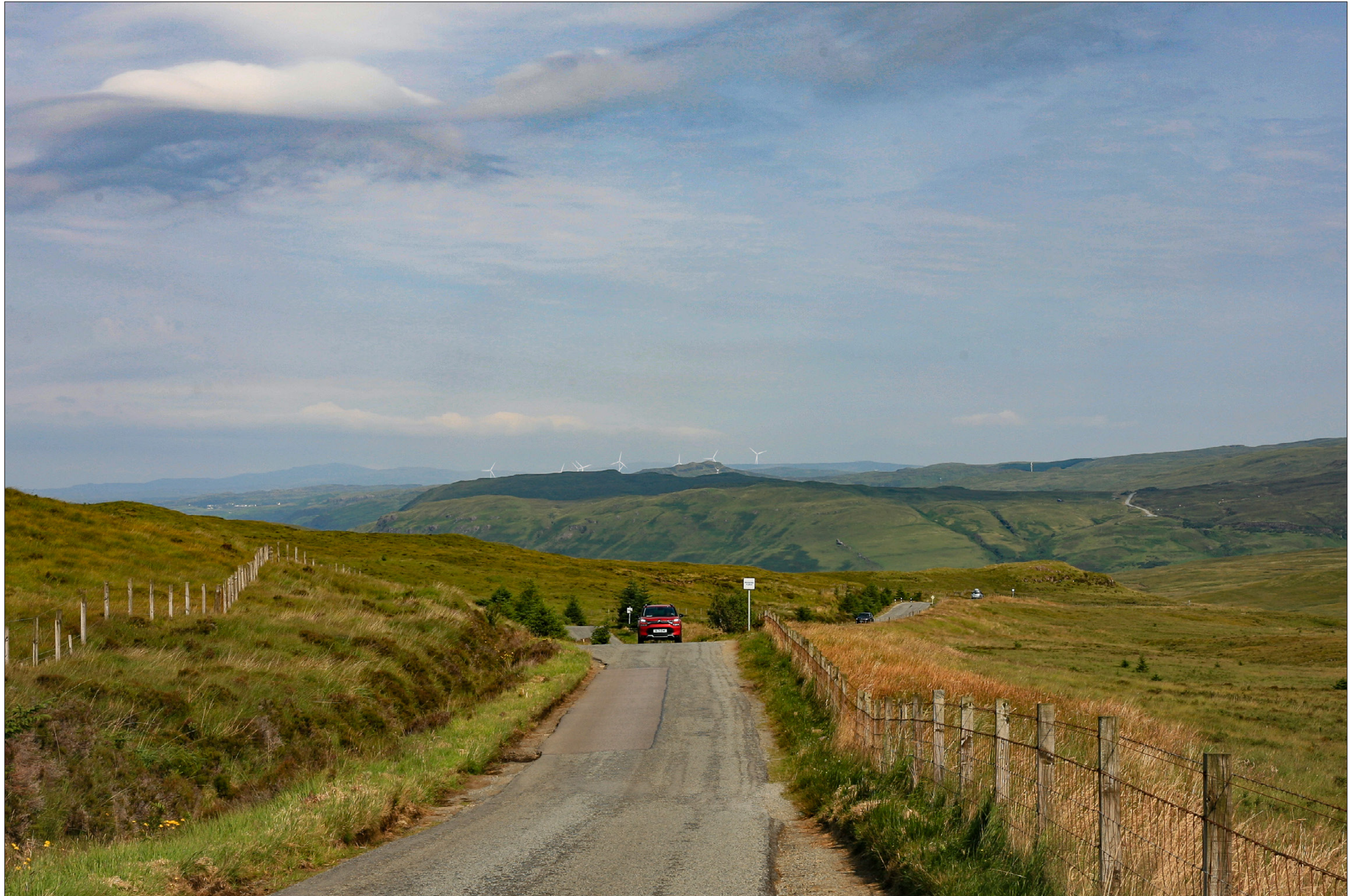
Viewpoint 16: Moineach Mararaulin

This image should be viewed at a comfortable arm's length (Approx. 500 mm)