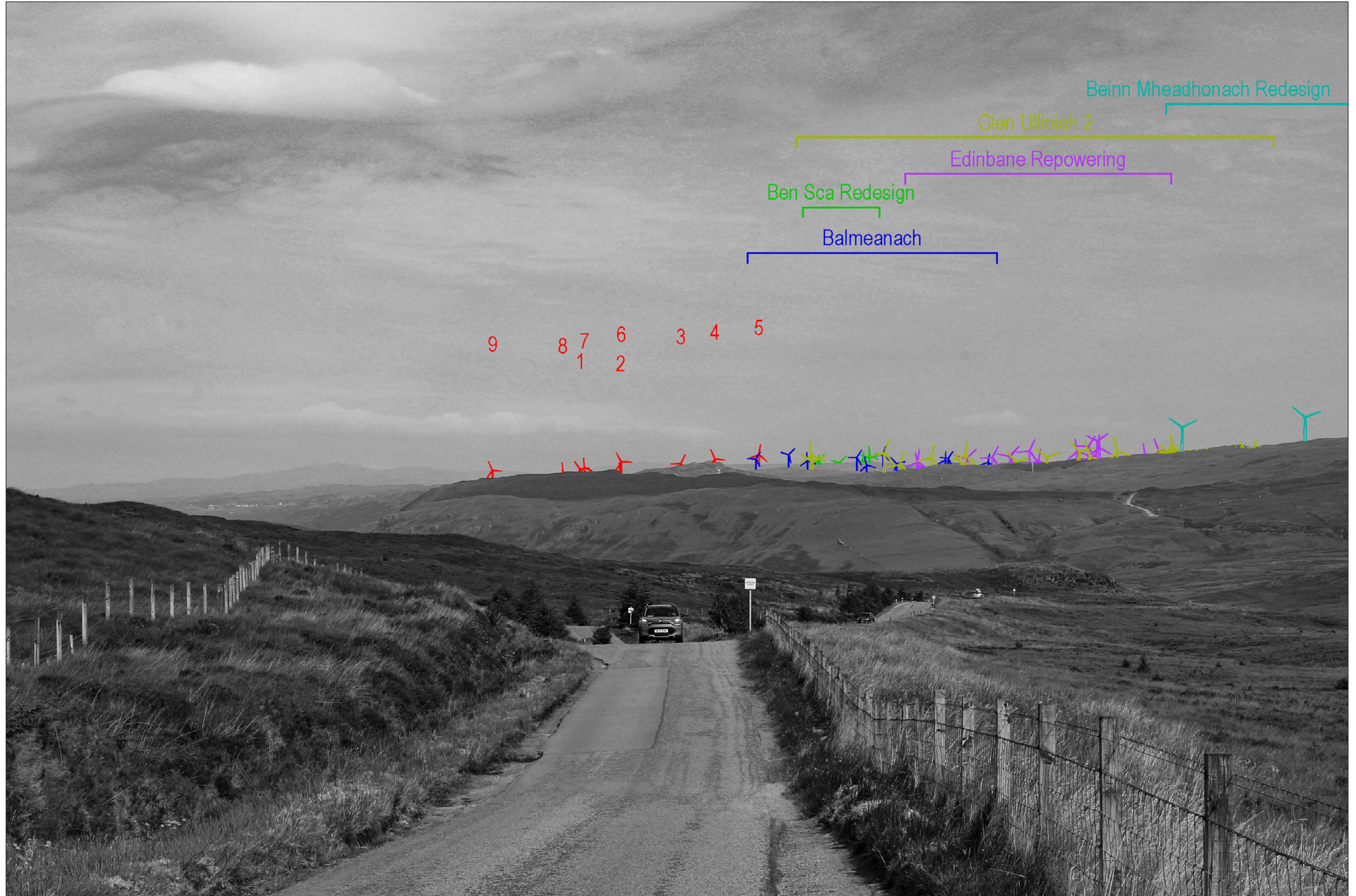
Viewpoint 16: Moineach Mararaulin - Monochrome Analysis

This image should be viewed at a comfortable arm's length (Approx. 500 mm)