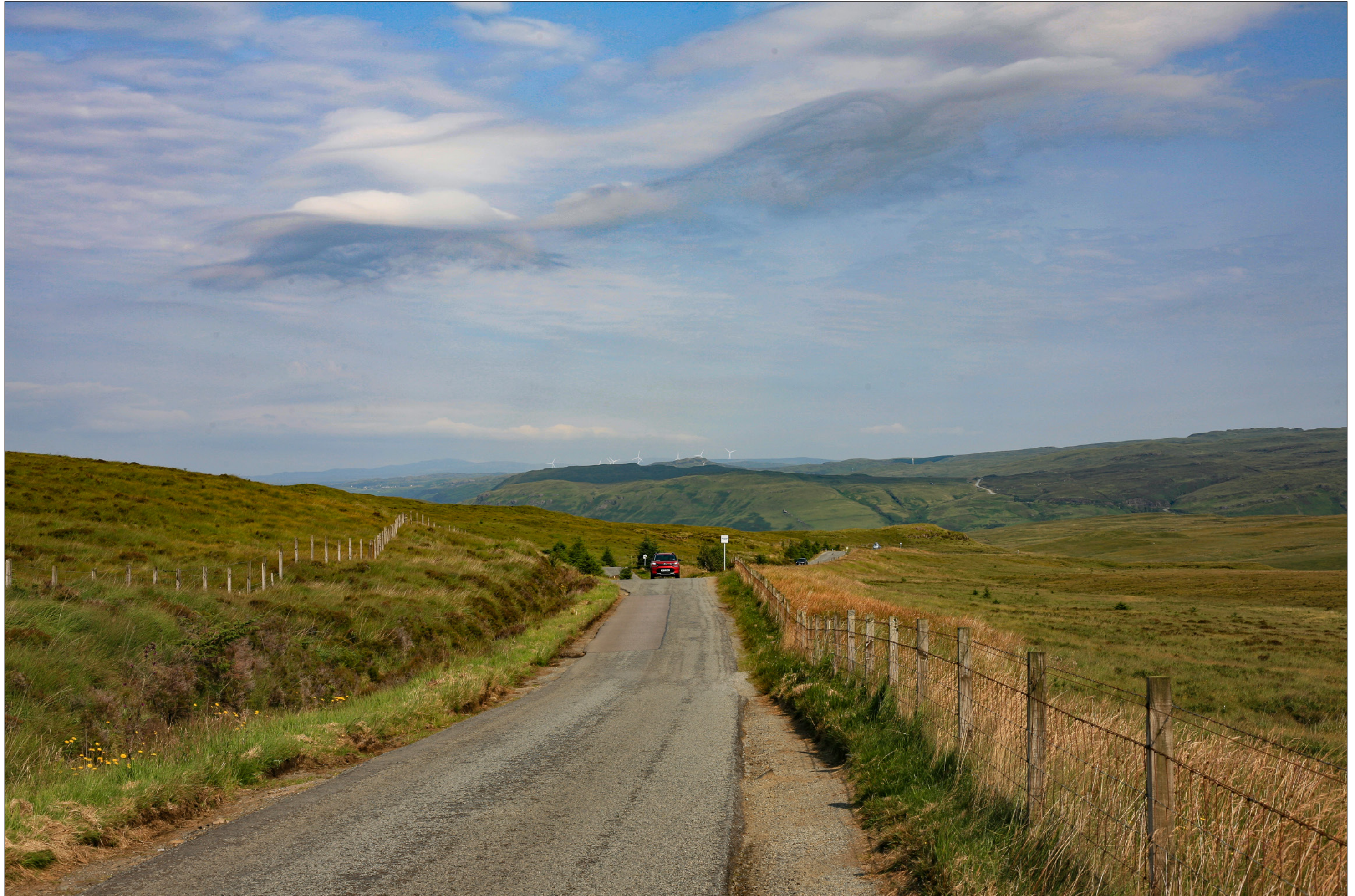
Viewpoint 16: Moineach Mararaulin

When viewed at a comfortable arm's length (approx. 500 mm), this printed image is representative of our detailed central vision, but is not representative of scale and distance.