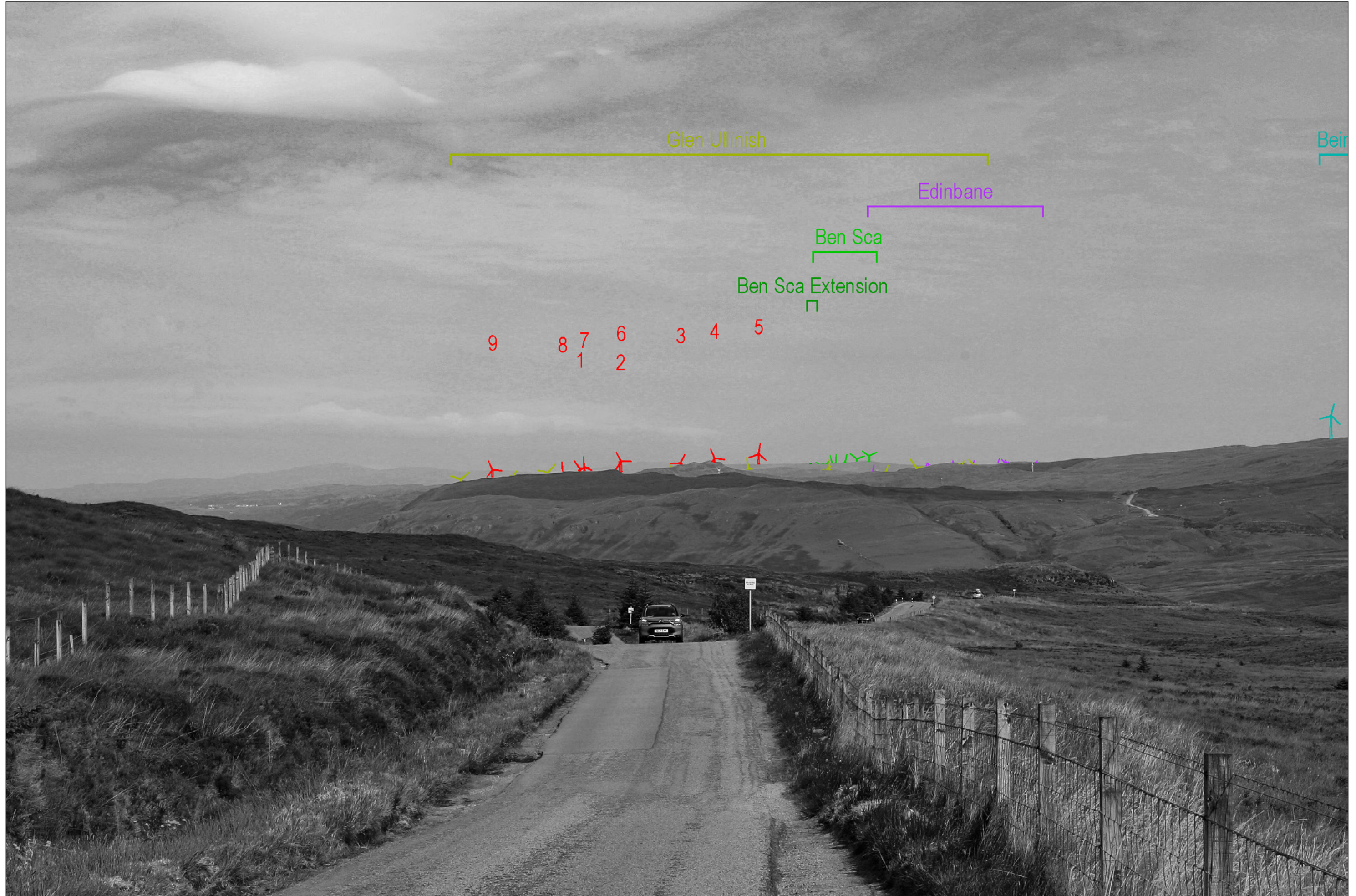
Viewpoint 16: Moineach Mararaulin - Monochrome Analysis

Planar Projection Distance to nearest turbine: 21.11 km Camera: Canon EOS 5D - Full Frame Focal length: 75 mm Camera Height: 1.5 m Date: 19/07/2022 Time: 10:36